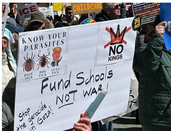
No Kings protest, Cleveland, March 28, 2026.

But why does the Pentagon need $1.5 trillion annually? In the first four weeks of war against Iran, the U.S. used over 850 “Tomahawk” missiles, costing close to $4 million each. And then there are the planes shot down by Iran’s “devastated” air defense system. As of April 5, these include four F-15Es, four KC-135s (refueling planes), plus one AWACS and one A-10 destroyed during Iran’s attacks on military bases. Replacement of these multimillion-dollar war planes could run into the billions.