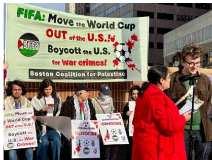
WW PHOTO: STEVE KIRSCHBAUM