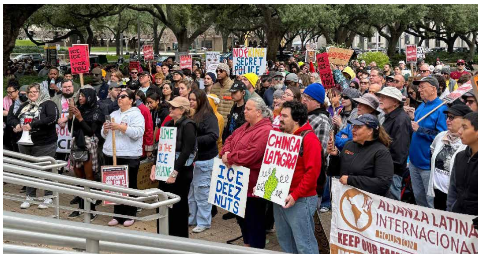
Houston, 10 de enero de 2026.

El Senado votó entonces a favor de pagar a los trabajadores de la TSA, pero el proyecto de ley fue rechazado en la Cámara de Representantes, donde la mayoría republicana se quejó de que el proyecto carecía de una disposición para financiar íntegramente al ICE. Los demócratas del Congreso solo pretenden reducir la financiación del odiado ICE, que ha despertado la ira pública debido a sus numerosos