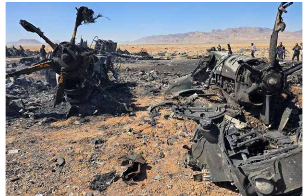
Four planes and two helicopters were among the reported losses in the ‘rescue’ of a downed specialist in Iran, April 5, 2026. $200 million in U.S. equipment lost and no reported (but many suspected) casualties.

“Check back soon for links to register your action and see a list of actions taking place on Tax Day, April 15, 2026.”