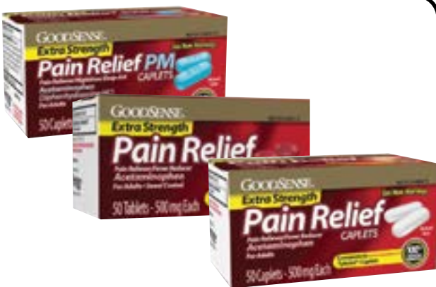
Good Sense Extra Strength Pain Relief 50 count Tablets, caplets or PM caplets.