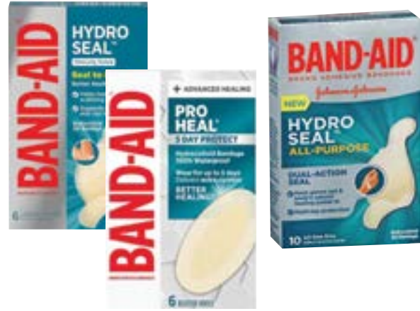
Band-Aid Hydro Seal™ or Pro Heal® 6 to 10 count Assorted.