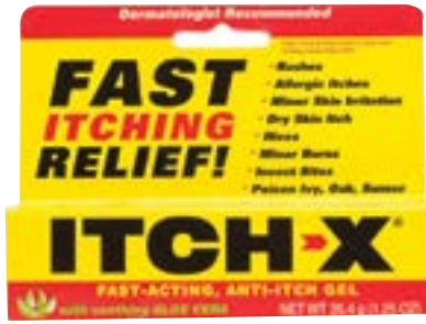
Itch-X Gel 1.25 ounce Fast acting, anti-itch gel.

Items may not be available at all locations.