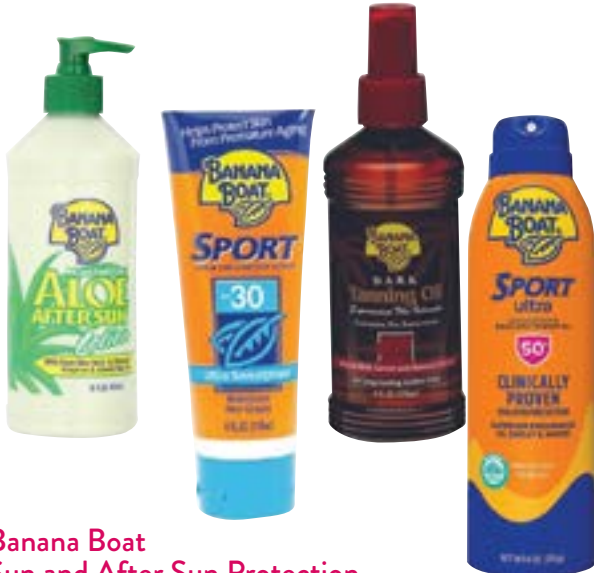
Banana Boat Sun and After Sun Protection 4 to 16 ounce Assorted formulas and SPF.