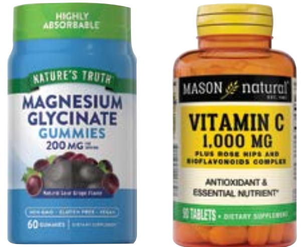
All Nature's Truth and Mason Vitamins in Stock