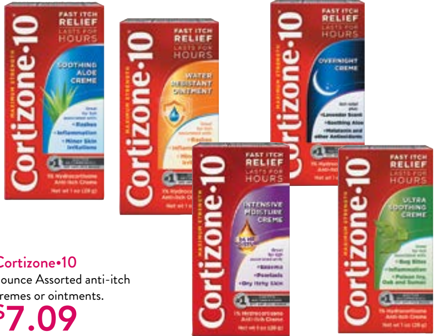
Cortizone-10 1 ounce Assorted anti-itch cremes or ointments.