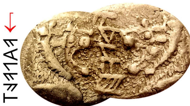
Fig. 1 Photoshop 76% opacity overlap of the right- & left-side of WALWET's Visit Card Electrum

Unfortunately none original writings of his or from his contemporary fellows did reach us , except one coin which carries the name Walwet, the king of Lydia, called Alyattes in Greek. Walwet means Lion in Lydian. This coin is the very first ever struck. Walwet is written downwards under the guard of two lion's heads. This epigraphic-iconic pattern has been engraved on a hard bronze punch-die. Its dimension was too large for the available flans ( blank metal disk ), the commonly certified 12 mm wide weight of 4,76 g Electrum, also called Electrum Trite or Third Stater. The strike of two flans has therefore been necessary, each covering the head of a lion, the name Walwet, and barely the opposite lion's mouth. Was it an early version of the dollar bill torn apart trick? I had the chance to identified two coins [1] , [2] which have being struck on the same die. The overlap with Photoshop of the pictures of those two coins reveals the royal Electrum Visit Card , see Fig.1.