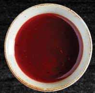
SWEET & SPICY