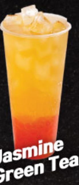
Jasmine Green Tea