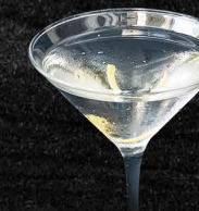
DRY MARTINI 16.98 Gin, Dry Vermouth