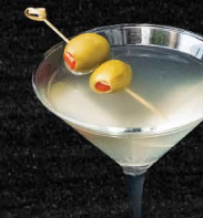
DIRTY MARTINI 16.98 Vodka, Olive Juice, Olives