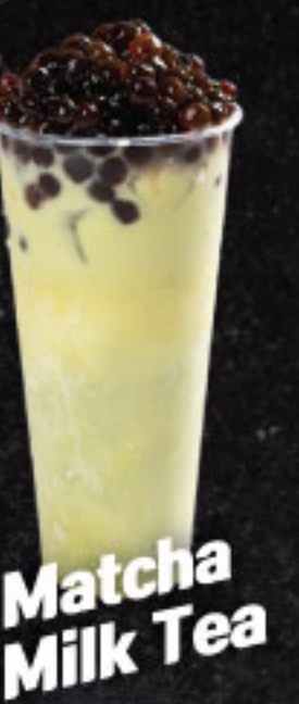
Matcha Milk Tea