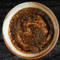
GARLIC & HERB