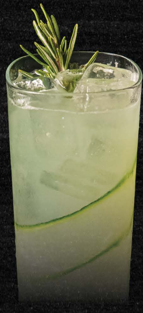
ROMERITO 17.98 Gin, Cucumber, Rosemary