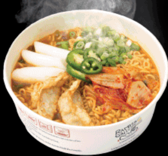
• SHIN RAMYUN (SPICY)