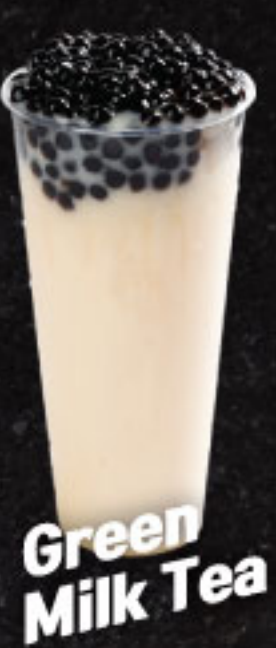
Green Milk Tea