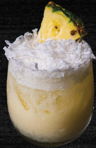
PINEAPPLE COCONUT MARGARITA 17.98 Tequila, Pineapple, Coconut