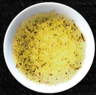
GREEN TEA SALT