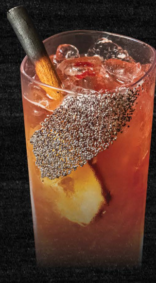
SMOKEY APPLE 17.98 Bourbon, Apple Juice, Campari, Cinnamon