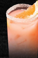
PALOMA 16.98 Tequila, Lime, Grapefruit