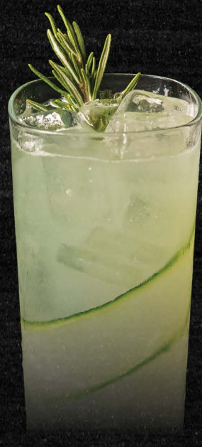
ROMERITO 16.98 Gin, Cucumber, Rosemary