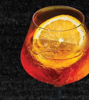
APEROL SPRITZ 14.98 Prosecco, Aperol, Soda