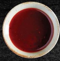
SWEET & SPICY