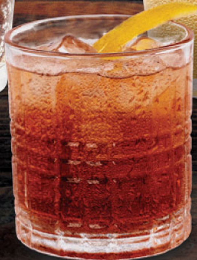
Maple Soju Old Fashion