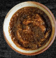
GARLIC & HERB