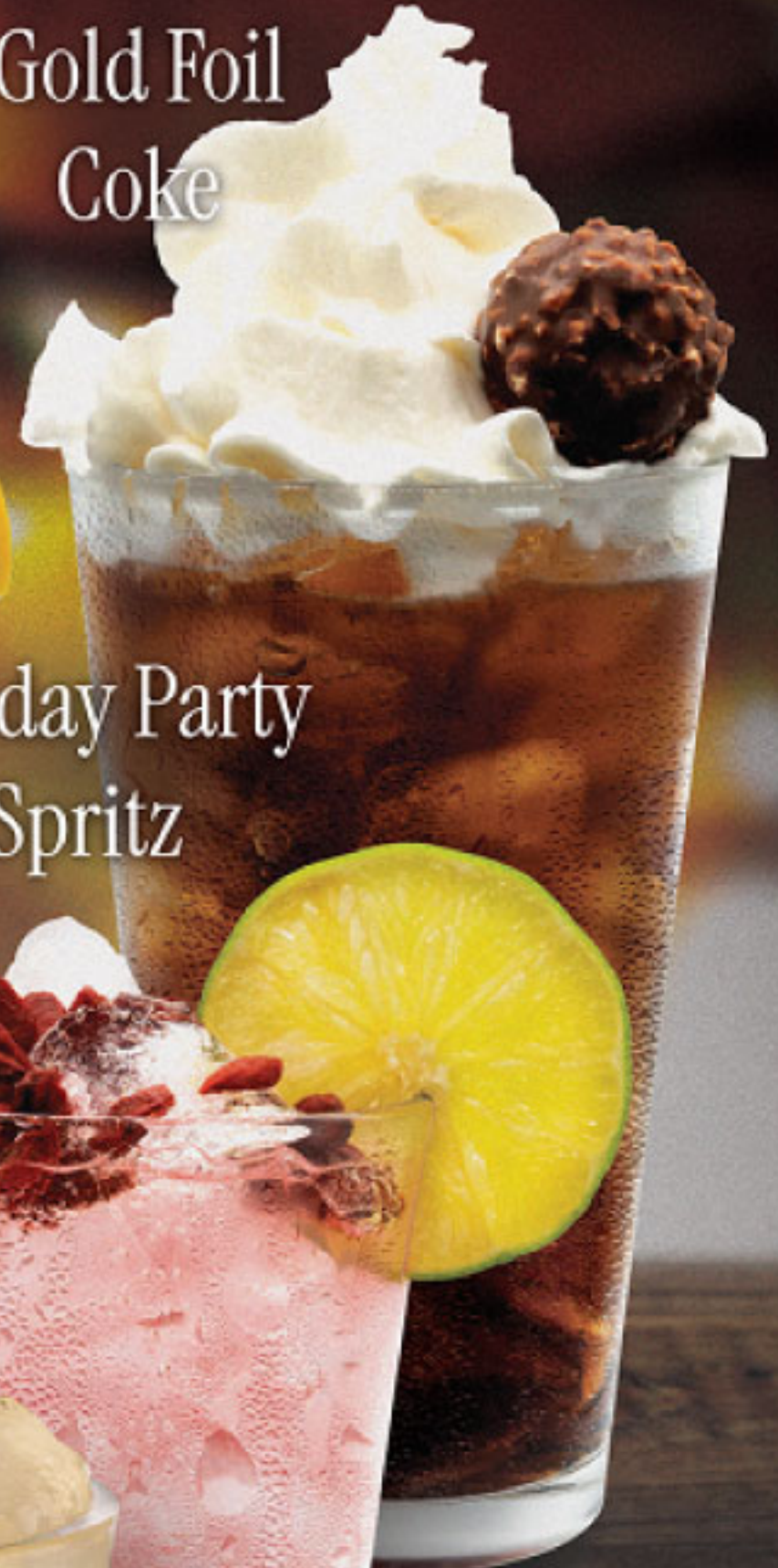
Gold Foil Coke