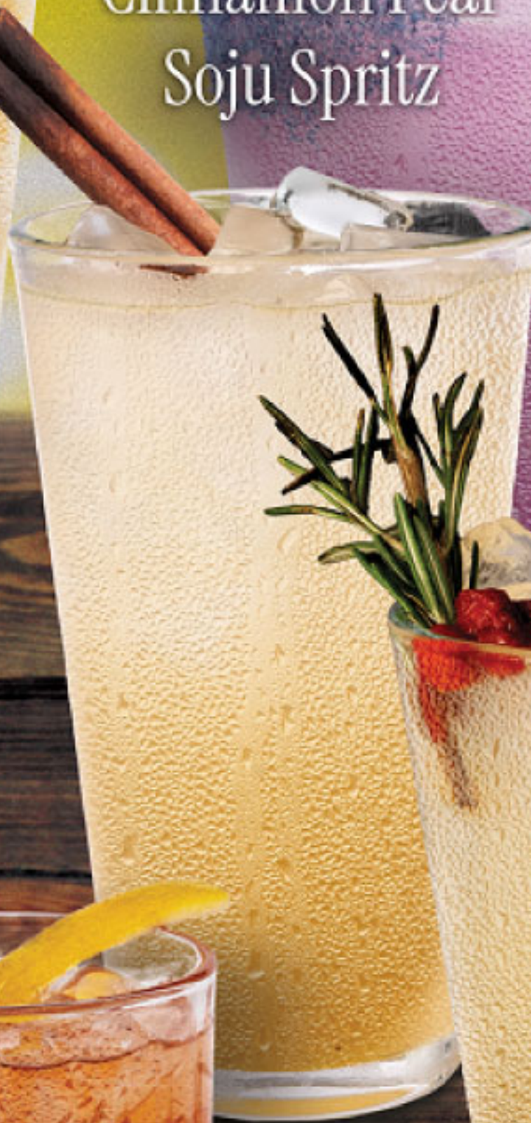
Cinnamon Pear Soju Spritz