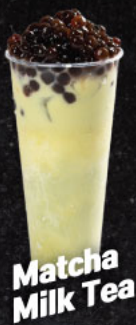
Matcha Milk Tea