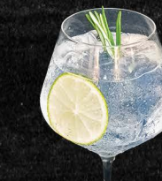
GIN & TONIC 14.98 Gin, Lime, Tonic Water