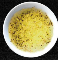
GREEN TEA SALT