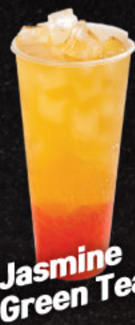
Jasmine Green Tea