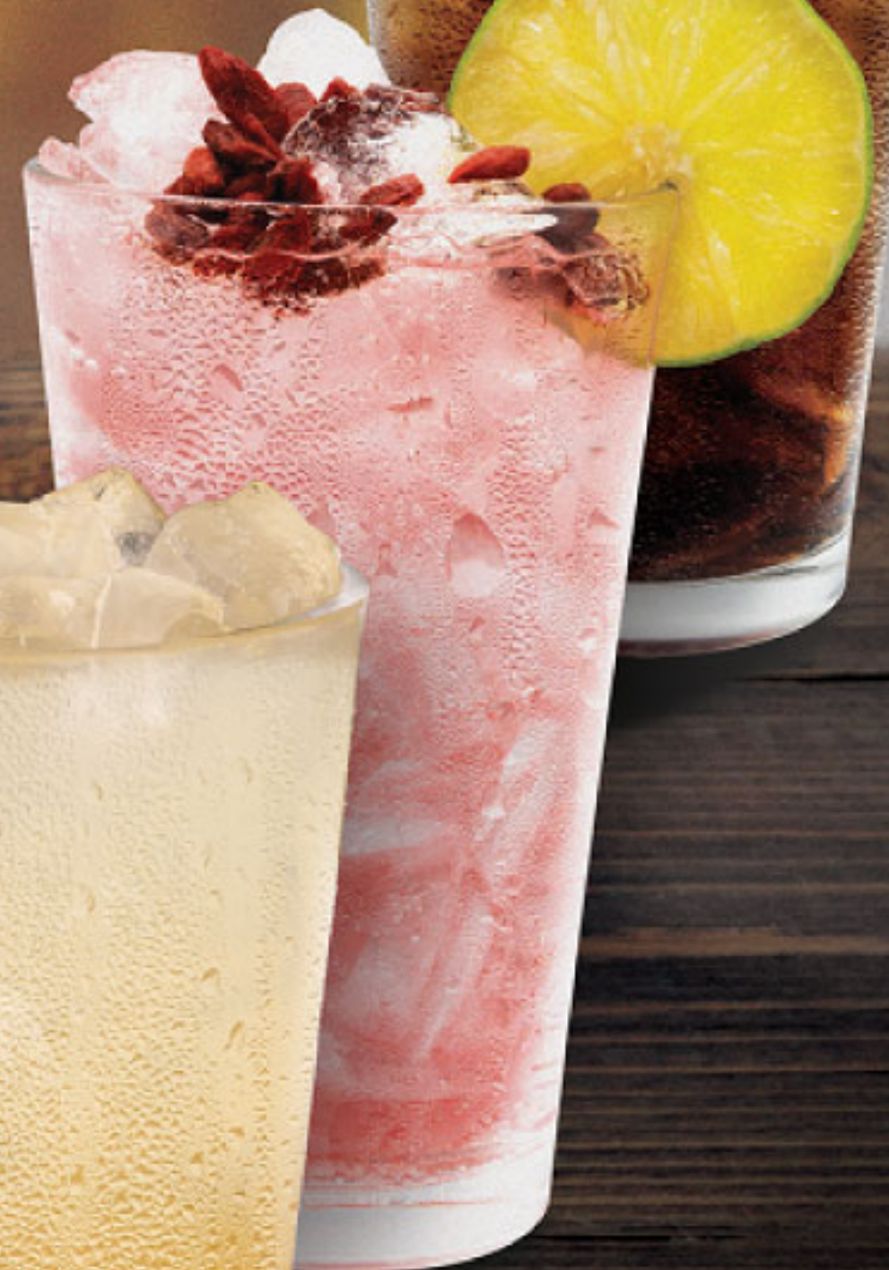
Holiday Party Spritz