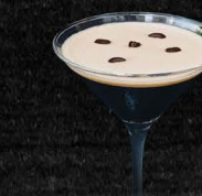
ESPRESSO MARTINI 15.98 Vodka, Espresso Coffee