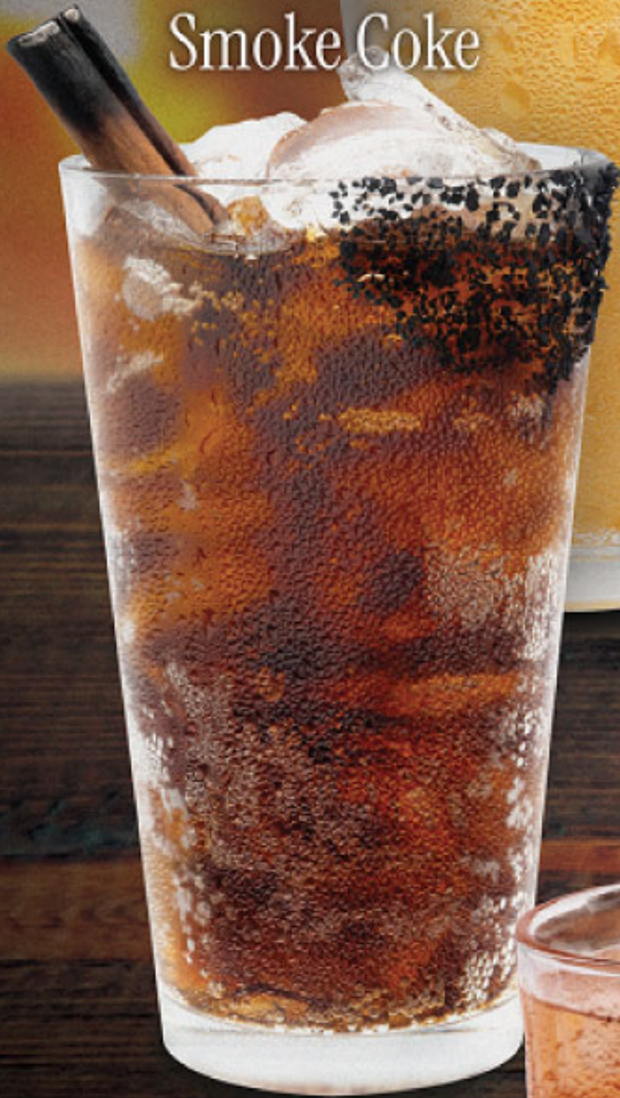
Cinnamon Smoke Coke