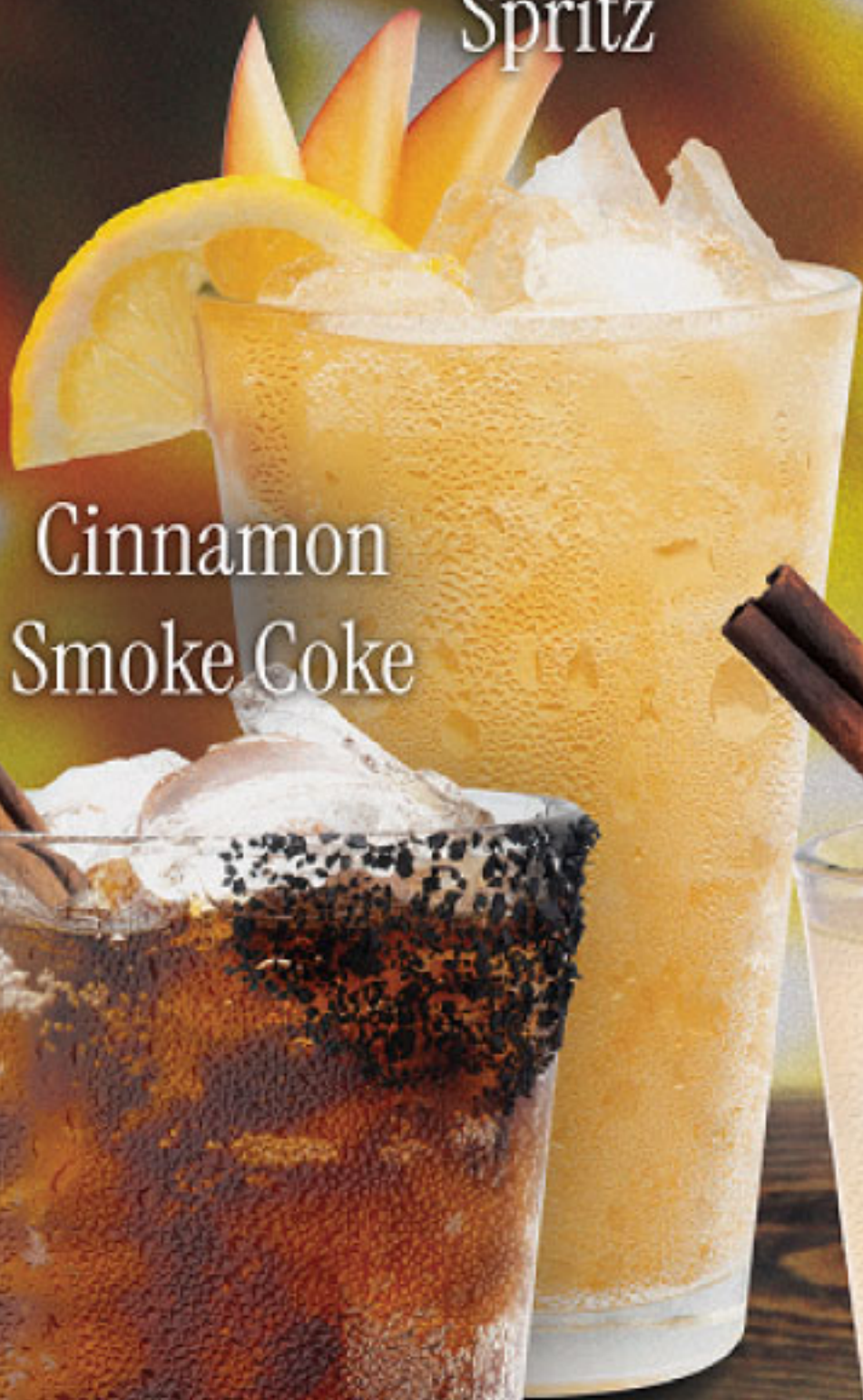
Caramel Apple Spritz