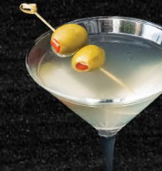
DIRTY MARTINI 15.98 Vodka, Olive Juice, Olives