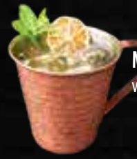
MOSCOW MULE 16.98 Vodka, Lime, Ginger Beer