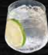
TEQUILA SODA 15.98 Tequila, Lime, Soda