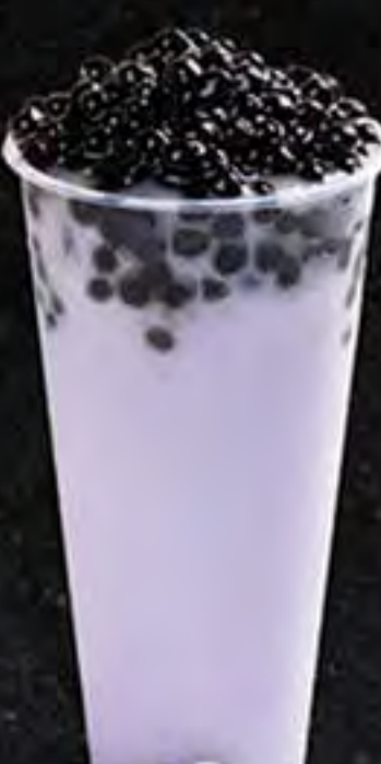
Taro Milk Tea