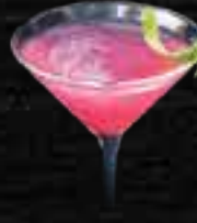
COSMOPOLITAN 16.98 Vodka, Cranberry Juice, Triple Sec