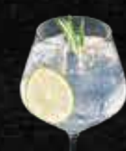
GIN & TONIC 15.98 Gin, Lime, Tonic Water