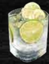
VODKA SODA 15.98 Vodka, Lime, Soda