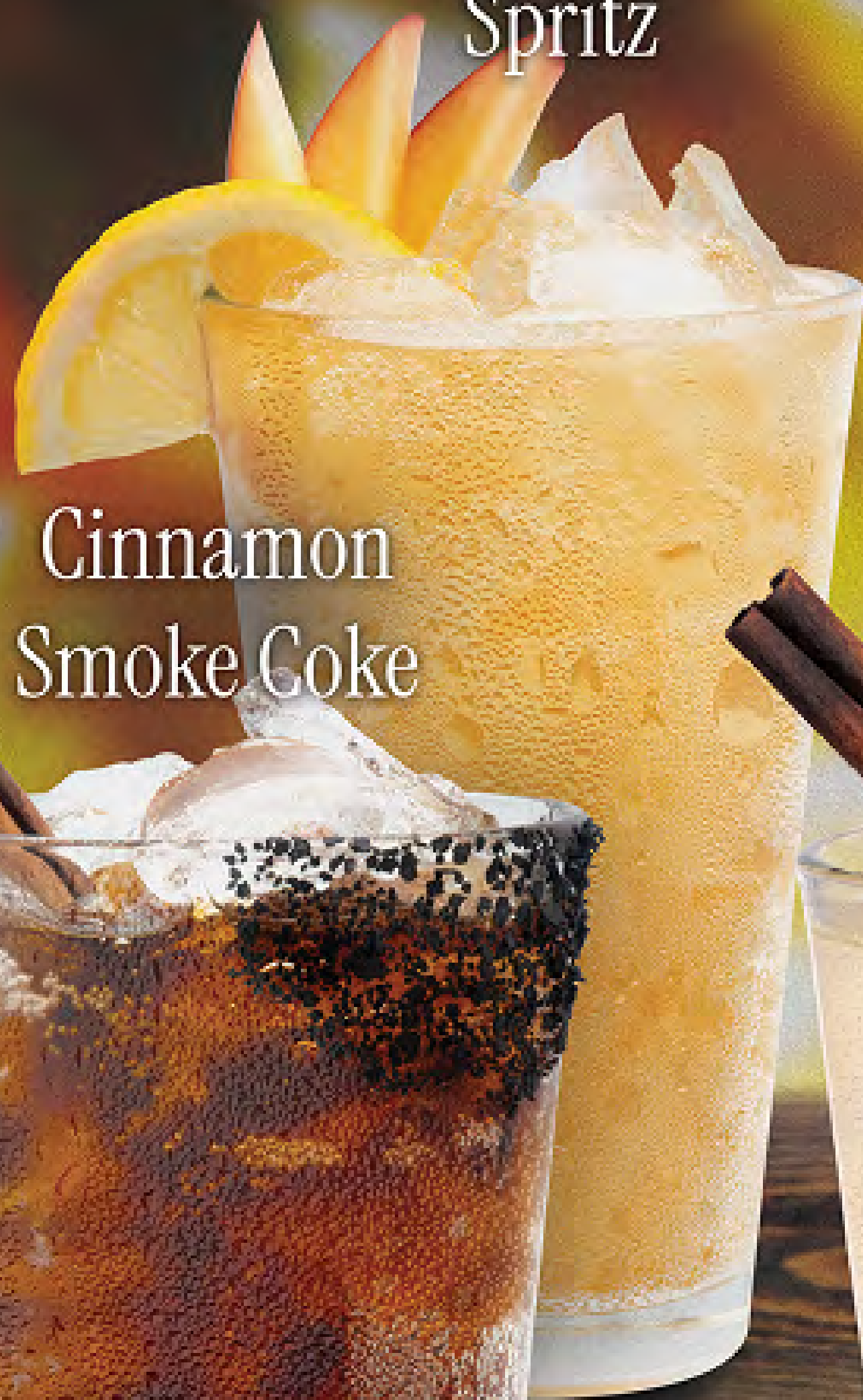
Caramel Apple Spritz