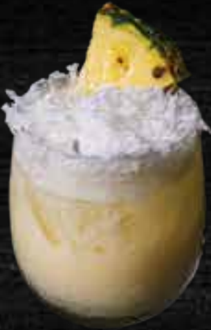
PINEAPPLE COCONUT MARGARITA 17.98 Tequila, Pineapple, Coconut