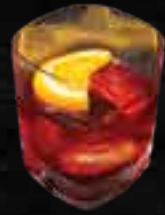
NEGRONI 15.98 Gin, Red Bitter, Sweet Vermouth