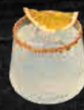
MEZCALITA 16.98 Mezcal, Triple Sec, Lime, Simple Syrup