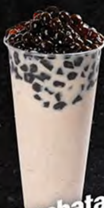
Horchata Milk Tea

Explore our full lineup of signature boba drinks!