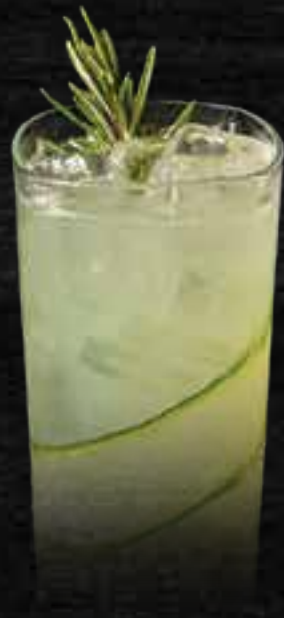
ROMERITO 17.98 Gin, Cucumber, Rosemary