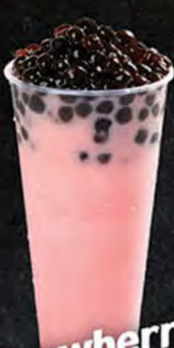
Strawberry Milk Tea