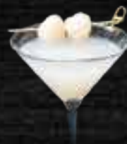
LYCHEE MARTINI 16.98 Vodka, Lychee Syrup