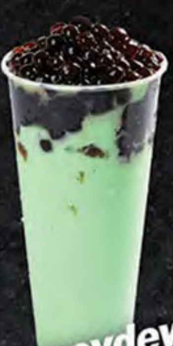
Honeydew Milk Tea