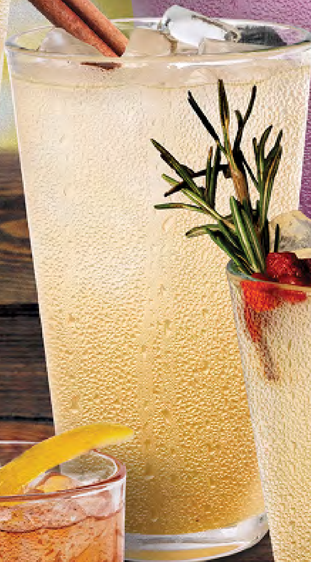
Cinnamon Pear Soju Spritz