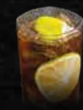
CUBA LIBRE 15.98 Rum, Lime, Coke