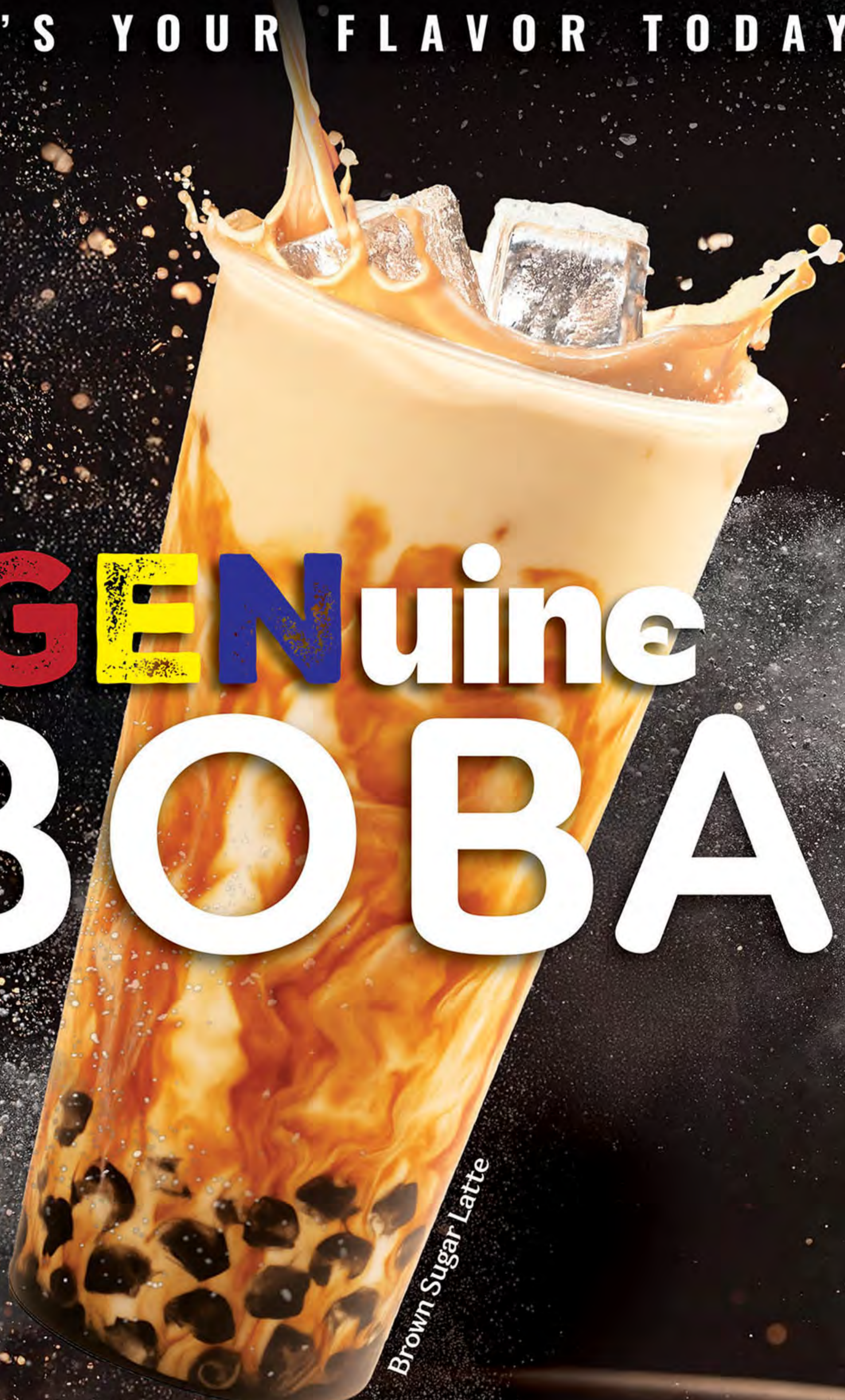
Brown Sugar Latte