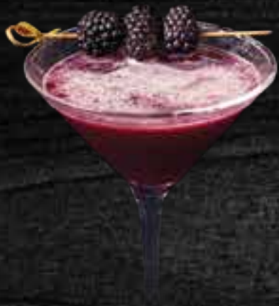
BLACKBERRY & NUTELLA MARTINI 17.98 Gin, Nutella, Blackberries