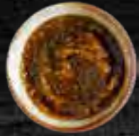
GARLIC & HERB