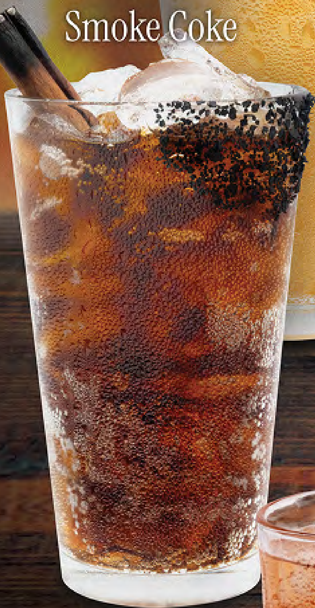
Cinnamon Smoke Coke