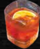
OLD FASHIONED 16.98 Bourbon, Angostura Bitters, Simple Syrup