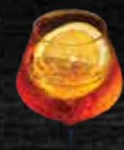
APEROL SPRITZ 15.98 Prosecco, Aperol, Soda