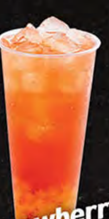
Strawberry Green Tea