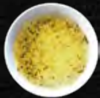
GREEN TEA SALT