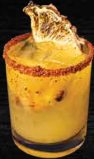
TEPACHE MARGARITA 17.98 Tequila, Roasted Pineapple, Agave Syrup