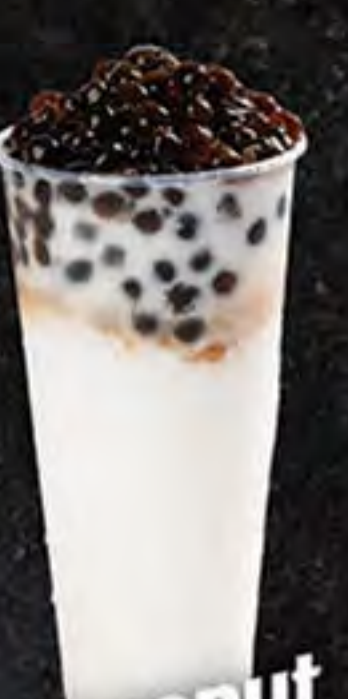
Coconut Milk Tea