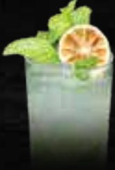
MOJITO 15.98 Rum, Mint, Soda