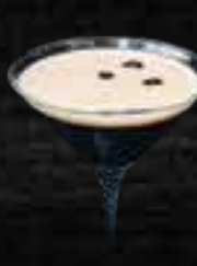
ESPRESSO MARTINI 15.98 Vodka, Borghetti, Espresso Coffee