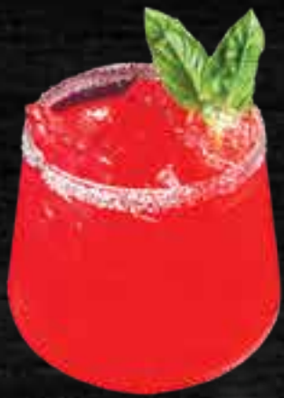
WATERMELON & BASIL 17.98 Tequila, Watermelon, Basil