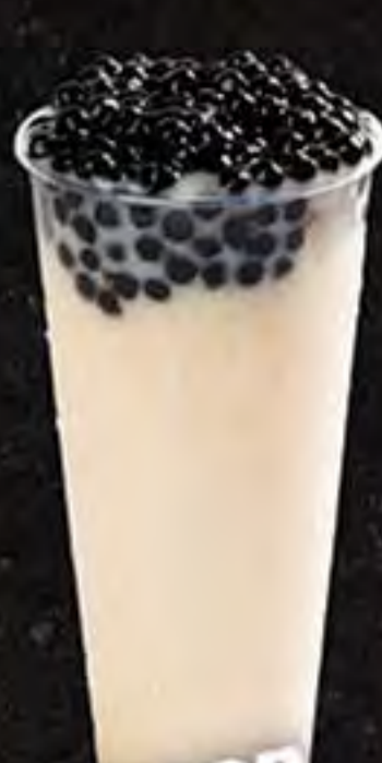
Green Milk Tea