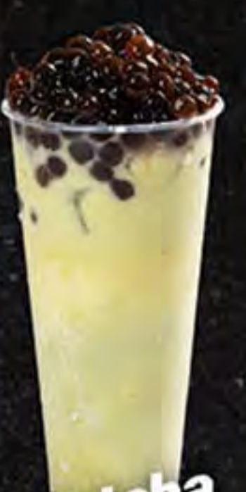
Matcha Milk Tea