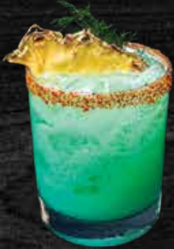
BLUE IGUANA 17.98 Rum, Blue Curacao, Mango, Coconut Cream