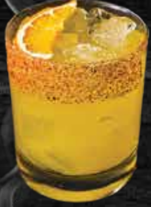
MIAMI HEAT 17.98 Tequila, Mango, Pineapple, Tajin