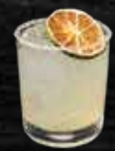
MARGARITA 16.98 Tequila, Triple Sec, Lime, Simple Syrup