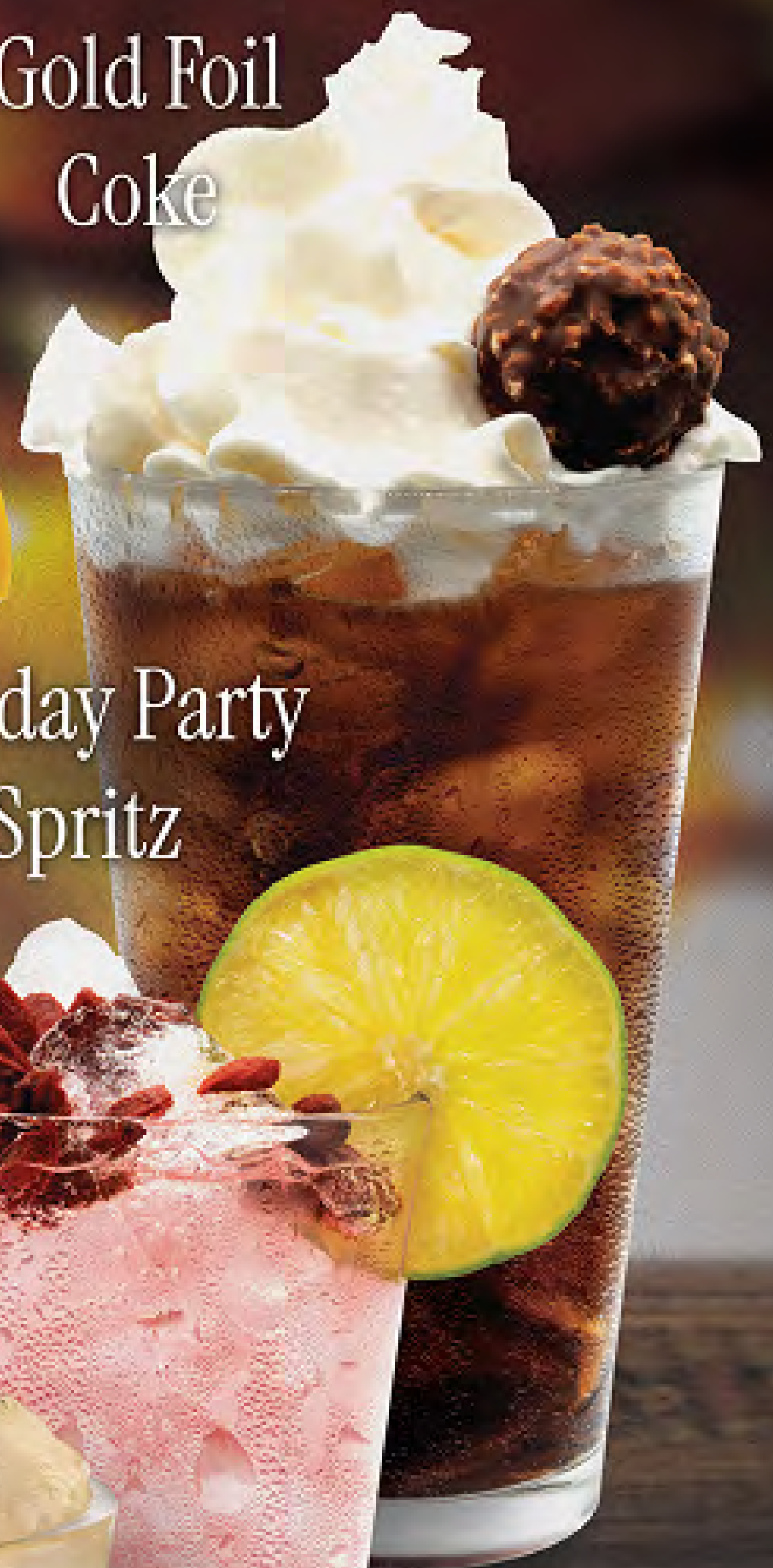
Gold Foil Coke