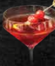
MANHATTAN 16.98 Bourbon, Angostura Bitters, Sweet Vermouth