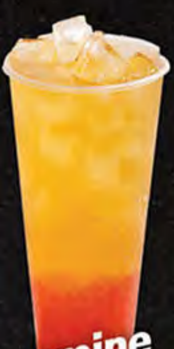
Jasmine Green Tea