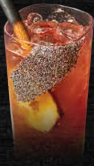
SMOKEY APPLE 17.98 Bourbon, Lime Juice, Apple Juice, Simple syrup, Campari