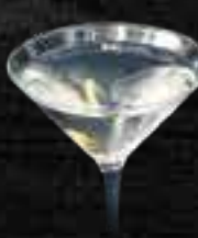
DRY MARTINI 16.98 Gin, Dry Vermouth