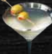
DIRTY MARTINI 16.98 Vodka, Olive Juice, Olives