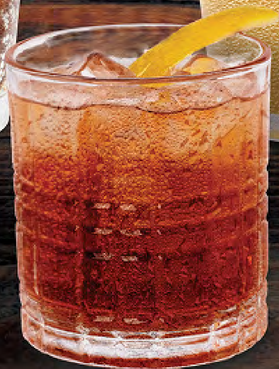
Maple Soju Old Fashion