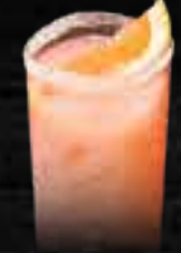
PALOMA 16.98 Tequila, Lime, Grapefruit