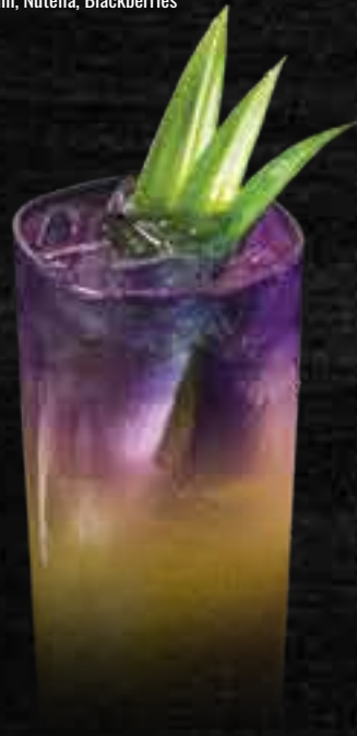
ROYAL HAWAIIAN 17.98 Gin Empress 1908, Agave Syrup, Pineapple