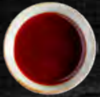
SWEET & SPICY