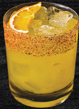
MIAMI HEAT 16.98 Tequila, Mango, Pineapple, Tajin