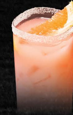
PALOMA 15.98 Tequila, Lime, Grapefruit