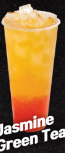
Jasmine Green Tea