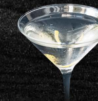
DRY MARTINI 15.98 Gin, Dry Vermouth