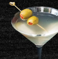
DIRTY MARTINI 15.98 Vodka, Olive Juice, Olives