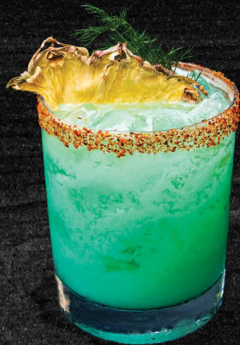
BLUE IGUANA 16.98 Rum, Blue Curacao, Mango, Condensed Milk