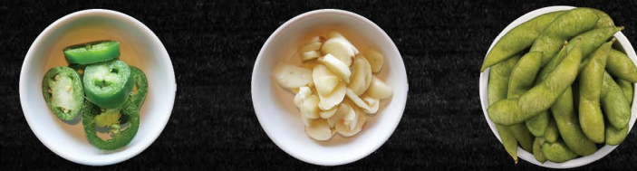
JALAPEÑO GARLIC EDAMAME