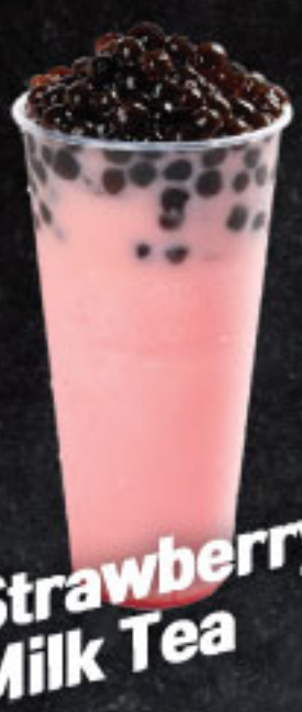
Strawberry Milk Tea