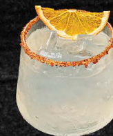
MEZCALITA 15.98 Mezcal, Triple Sec, Lime, Simple Syrup