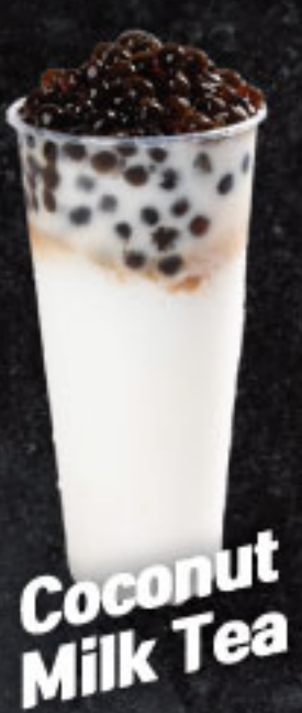
Coconut Milk Tea