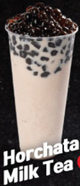
Horchata Milk Tea

Explore our full lineup of signature boba drinks!