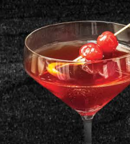
MANHATTAN 15.98 Bourbon, Angostura Bitters, Sweet Vermouth