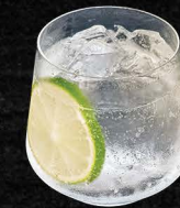
TEQUILA SODA 14.98 Tequila, Lime, Soda