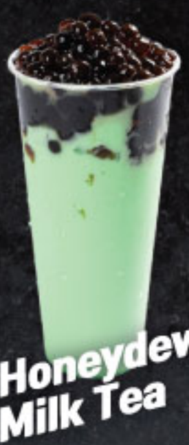
Honeydew Milk Tea