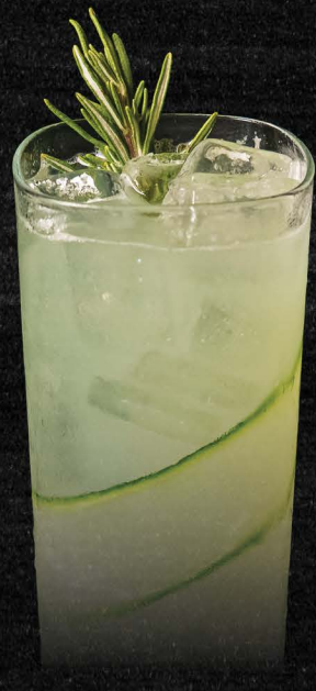
ROMERITO 16.98 Gin, Cucumber, Rosemary