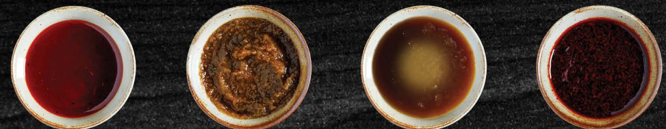
SWEET & SPICY GARLIC & HERB SWEET GARLIC SALAD SAUCE