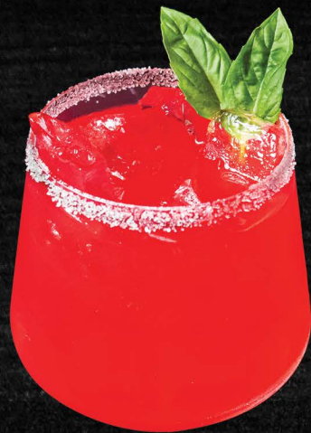
WATERMELON & BASIL 16.98 Tequila Reposado, Watermelon, Basil