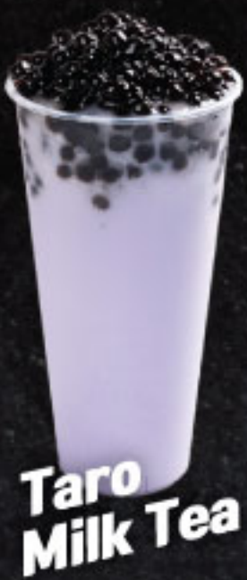
Taro Milk Tea