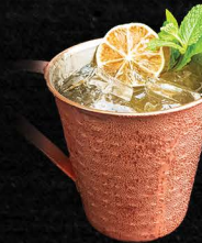
MOSCOW MULE 15.98 Vodka, Lime, Ginger Beer