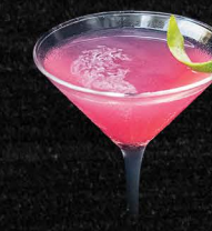
COSMOPOLITAN 15.98 Vodka, Cranberry Juice, Triple Sec