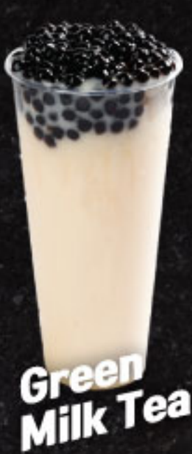
Green Milk Tea