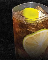
CUBA LIBRE 14.98 Rum, Lime, Coke