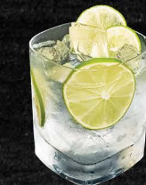
VODKA SODA 14.98 Vodka, Lime, Soda