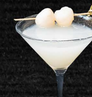
LYCHEE MARTINI 15.98 Vodka, Lychee Syrup