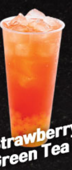
Strawberry Green Tea