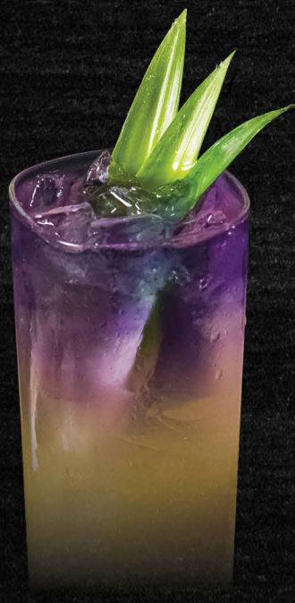
ROYAL HAWAIIAN 16.98 Gin Empress 1908, Agave Syrup, Pineapple