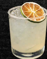
MARGARITA 15.98 Tequila, Triple Sec, Lime, Simple Syrup