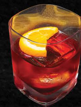
NEGRONI 15.98 Gin, Red Bitter, Sweet Vermouth