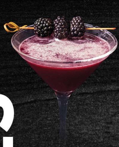
BLACKBERRY & NUTELLA MARTINI 16.98 Gin, Nutella, Blackberries