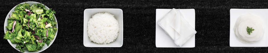
SALAD RICE RICE PAPER RADISH PAPER