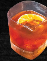
OLD FASHIONED 15.98 Bourbon, Angostura Bitters, Simple Syrup