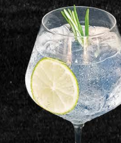
GIN & TONIC 14.98 Gin, Lime, Tonic Water