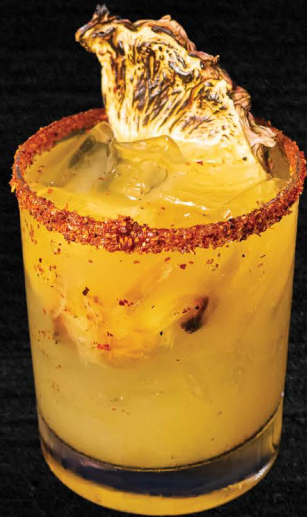
TEPACHE MARGARITA 16.98 Tequila Reposado, Roasted Pineapple, Agave Syrup