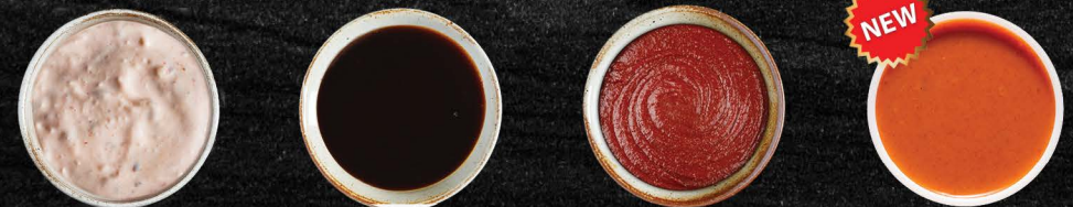
TARTAR SAUCE TONKATSU SAUCE K-SPICY SAUCE GOCHUJANG AIOLI