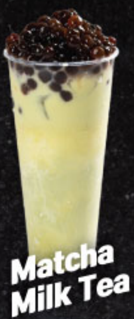
Matcha Milk Tea