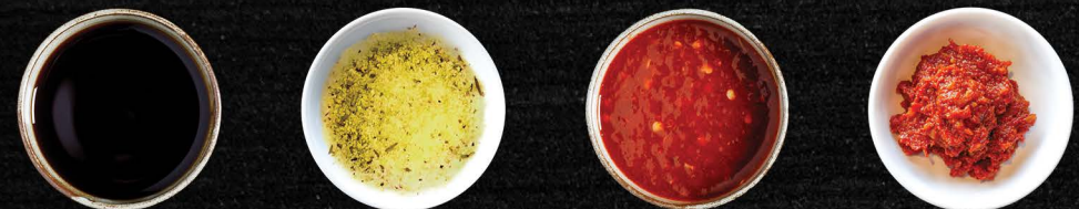
CHADOL SAUCE GREEN TEA SALT HOT SAUCE SSAMJANG