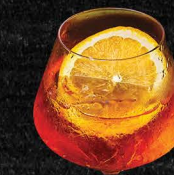
APEROL SPRITZ 14.98 Prosecco, Aperol, Soda