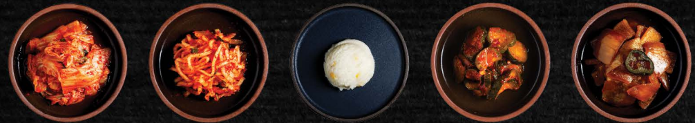
KIMCHI SANGCHAE POTATO SALAD CUCUMBER PICKLES