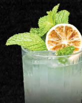
MOJITO 15.98 Rum, Mint, Soda