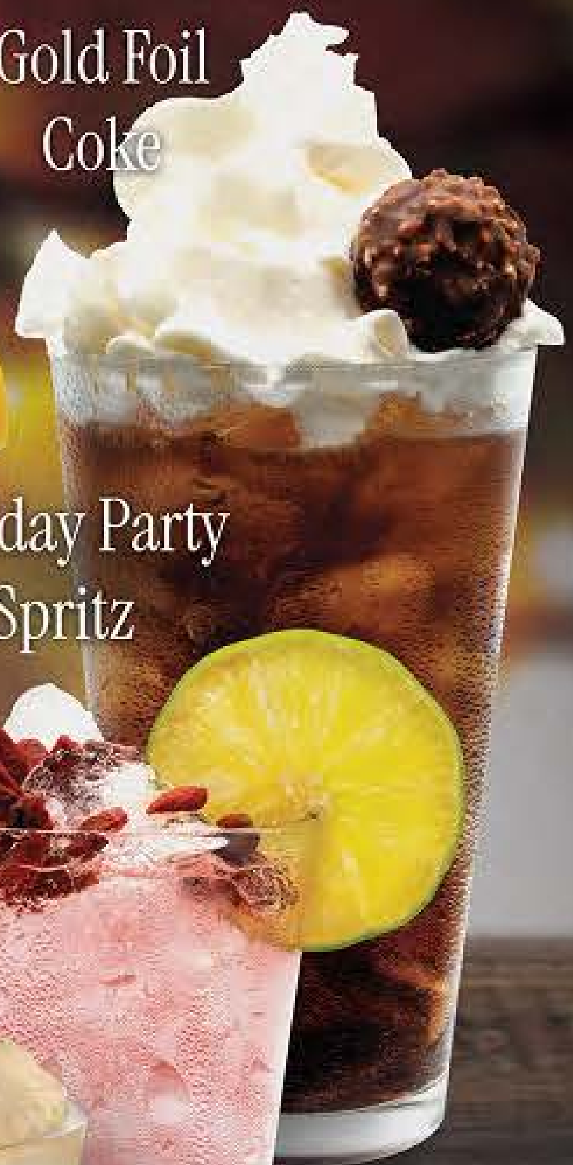
Gold Foil Coke