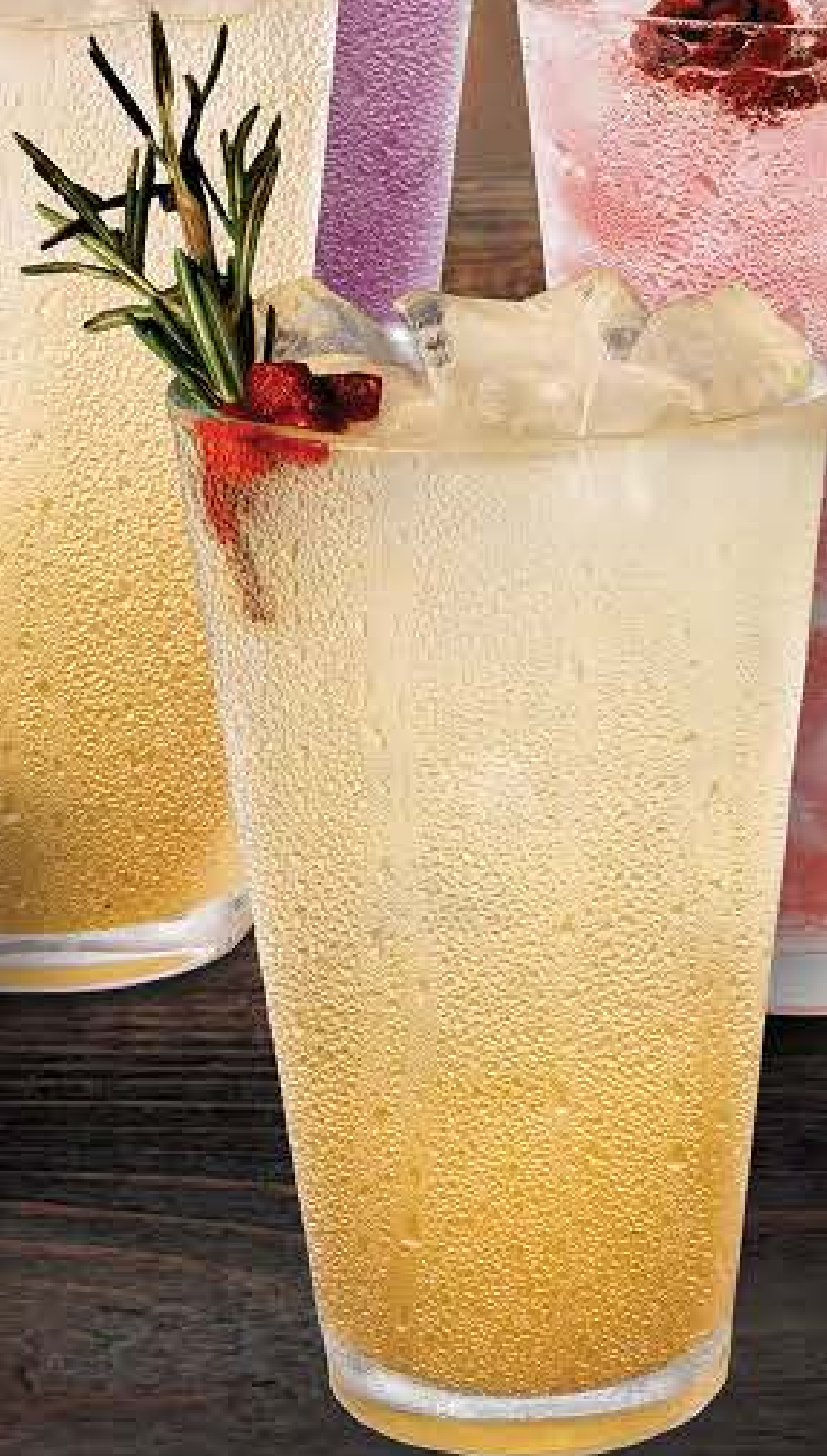
Pear and Ginger Soju Cooler