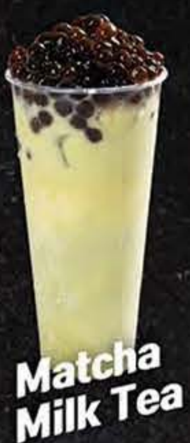
Matcha Milk Tea