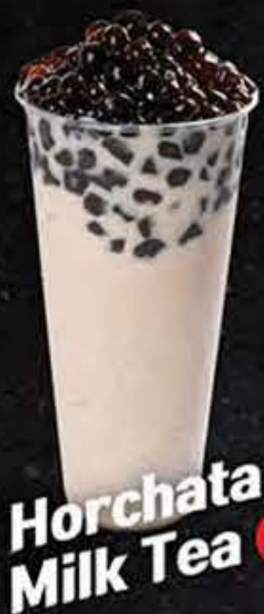
Horchata Milk Tea

Explore our full lineup of signature boba drinks!