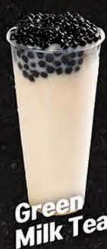
Green Milk Tea