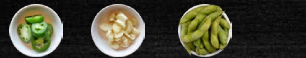
JALAPEÑO GARLIC EDAMAME