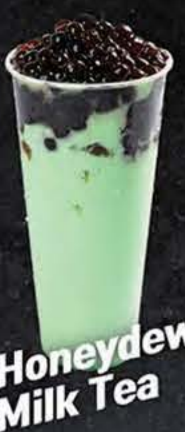
Honeydew Milk Tea