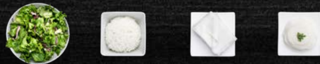
SALAD RICE RICE PAPER RADISH PAPER