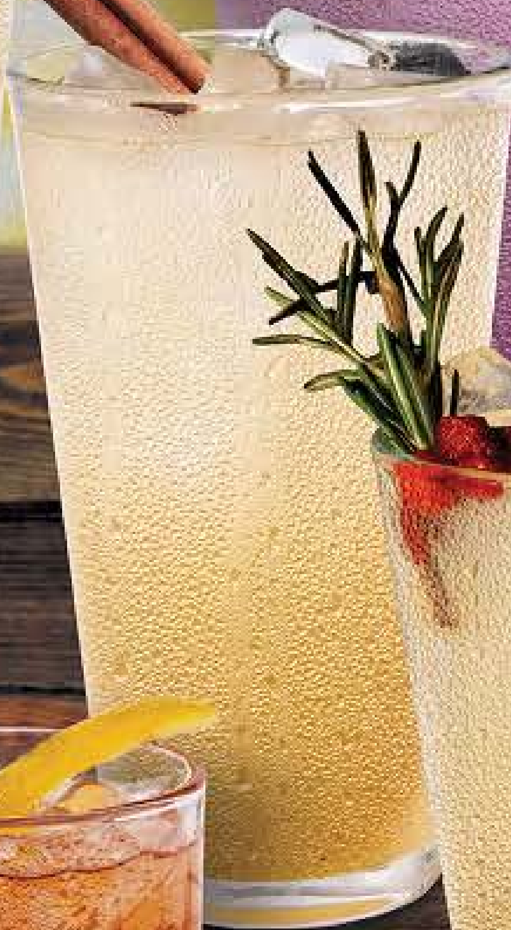
Cinnamon Pear Soju Spritz