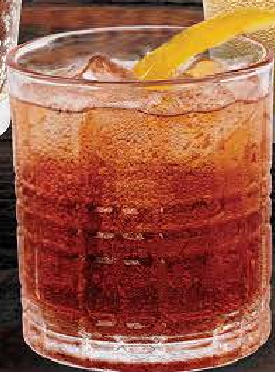
Maple Soju Old Fashioned