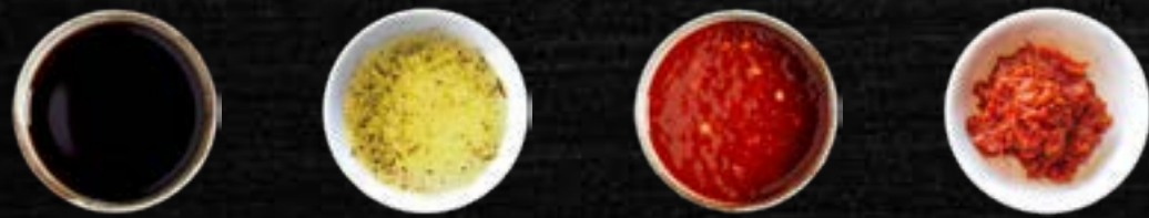
CHADOL SAUCE GREEN TEA SALT HOT SAUCE SSAMJANG