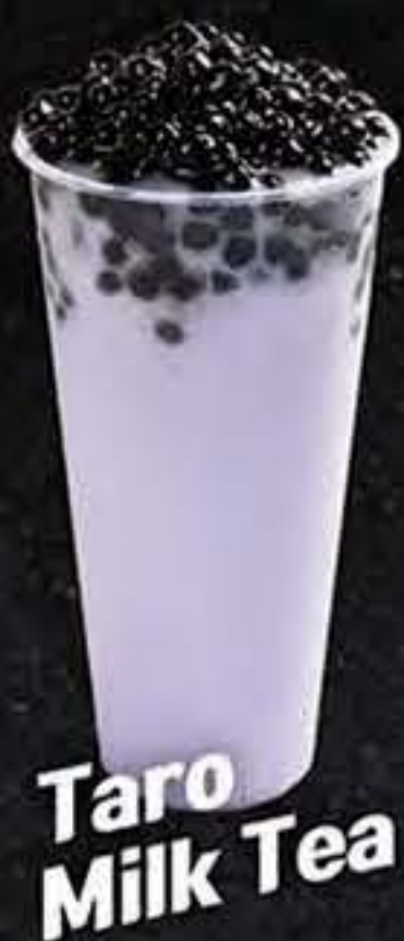
Taro Milk Tea