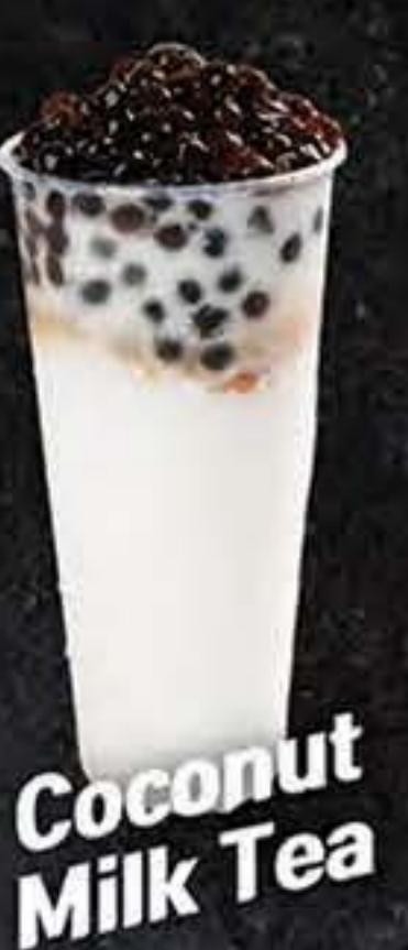
Coconut Milk Tea