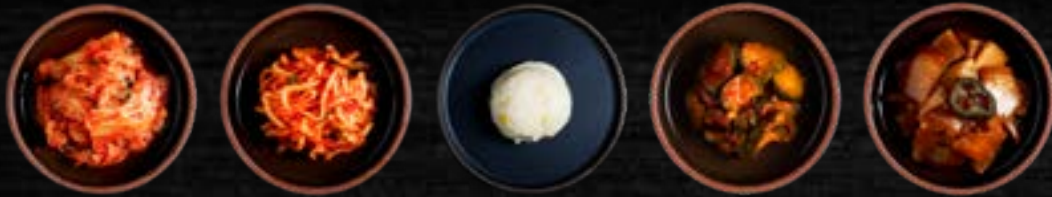
KIMCHI SANGCHAE POTATO SALAD CUCUMBER PICKLES