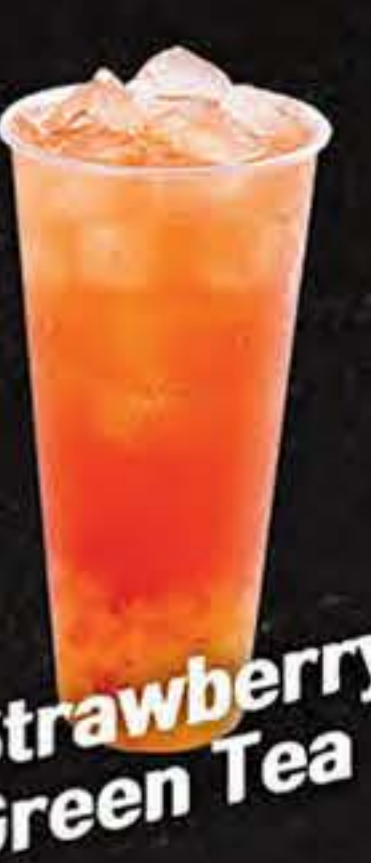
Strawberry Green Tea