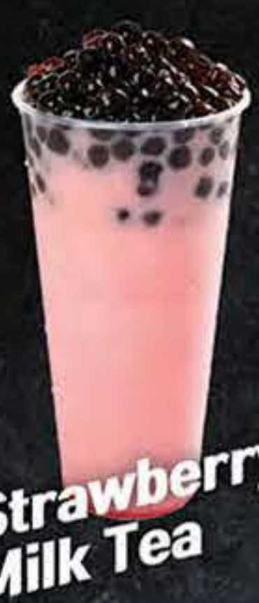
Strawberry Milk Tea