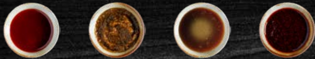
SWEET & SPICY GARLIC & HERB SWEET GARLIC SALAD SAUCE