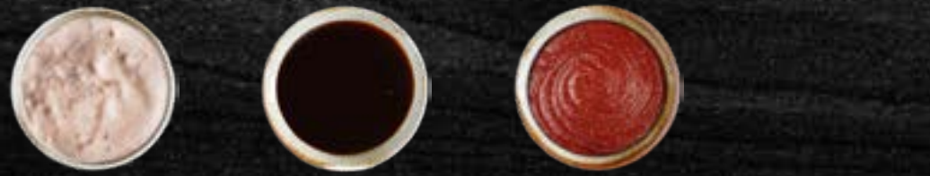
TARTAR SAUCE TONKATSU SAUCE K-SPICY