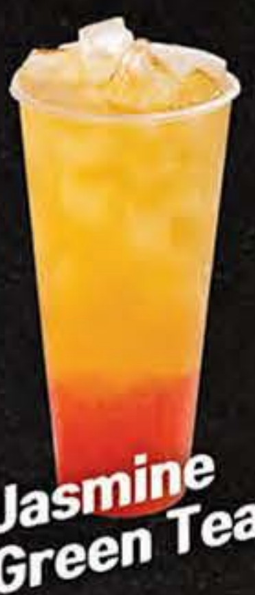
Jasmine Green Tea