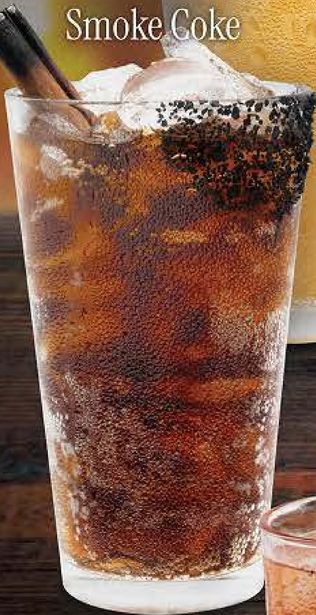
Cinnamon Smoke Coke