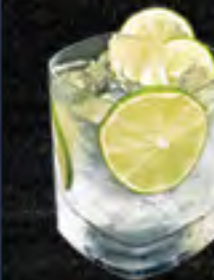
VODKA SODA 15.98 Vodka, Lime, Soda