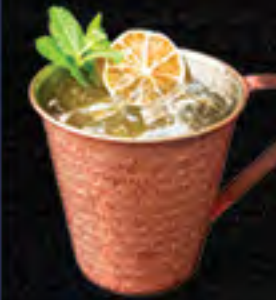
MOSCOW MULE 16.98 Vodka, Lime, Ginger Beer