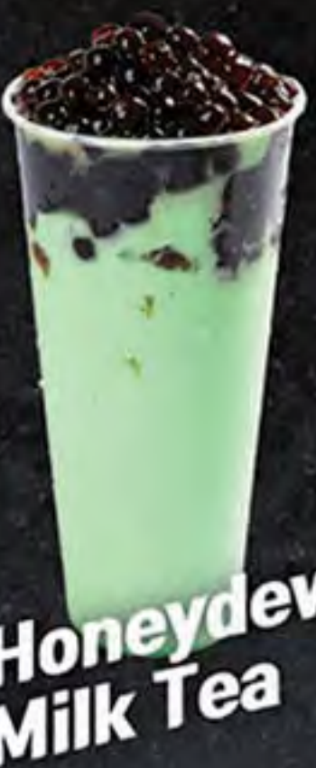
Honeydew Milk Tea