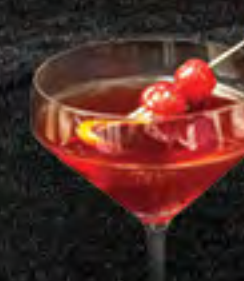
MANHATTAN 16.98 Bourbon, Angostura Bitters, Sweet Vermouth