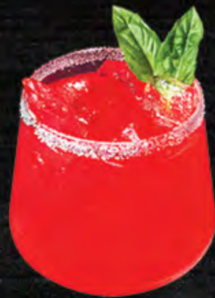
WATERMELON & BASIL 17.98 Tequila Reposado, Watermelon, Basil