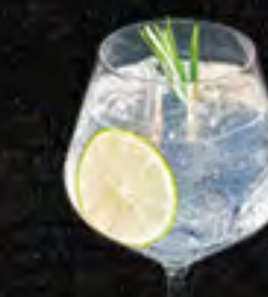
GIN & TONIC 15.98 Gin, Lime, Tonic Water