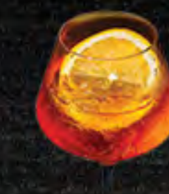
APEROL SPRITZ 15.98 Prosecco, Aperol, Soda