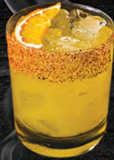
MIAMI HEAT 17.98 Tequila, Mango, Pineapple, Tajin