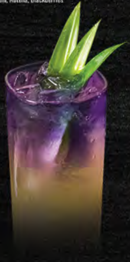
ROYAL HAWAIIAN 17.98 Gin Empress 1908, Agave Syrup, Pineapple