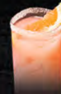
PALOMA 16.98 Tequila, Lime, Grapefruit