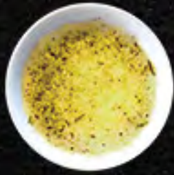
GREEN TEA SALT