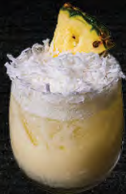
PINEAPPLE COCONUT MARGARITA 17.98 Tequila, Pineapple, Coconut