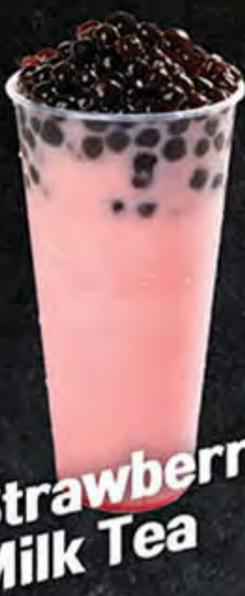
Strawberry Milk Tea