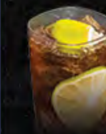
CUBA LIBRE 15.98 Rum, Lime, Coke