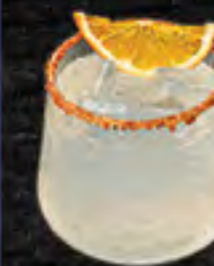
MEZCALITA 16.98 Mezcal, Triple Sec, Lime, Simple Syrup