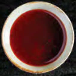
SWEET & SPICY