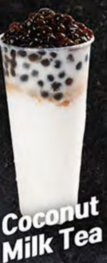
Coconut Milk Tea