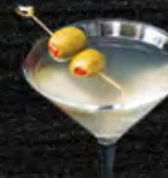
DIRTY MARTINI 16.98 Vodka, Olive Juice, Olives