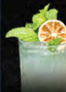
MOJITO 15.98 Rum, Mint, Soda