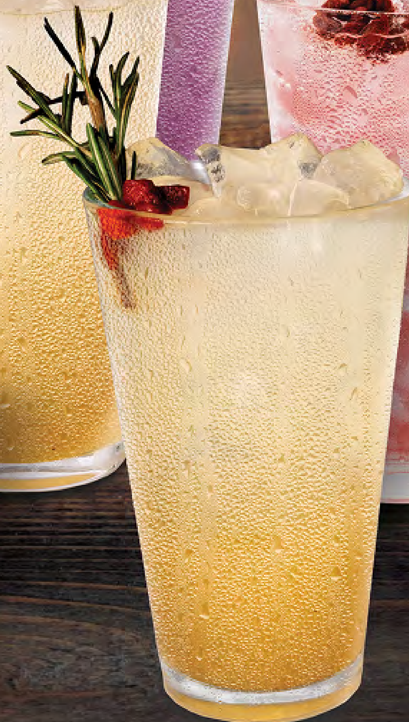
Pear and Ginger Soju Cooler