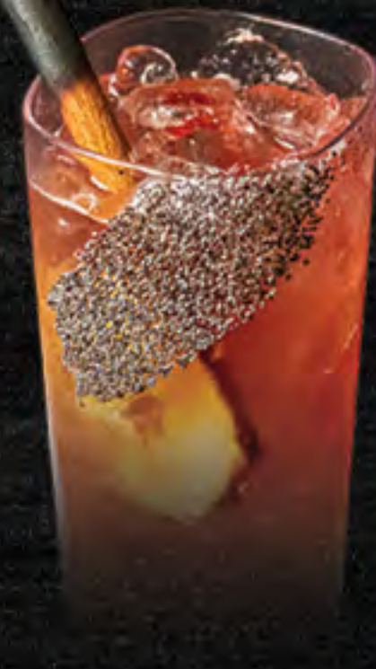
SMOKEY APPLE 17.98 Tequila, Mango, Pineapple, Tajin