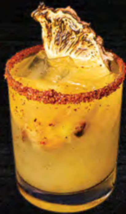
TEPACHE MARGARITA 17.98 Tequila Reposado, Roasted Pineapple, Agave Syrup