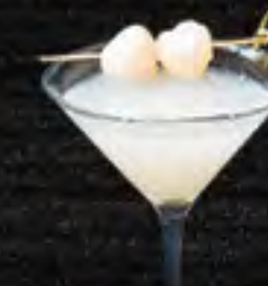
LYCHEE MARTINI 16.98 Vodka, Lychee Syrup