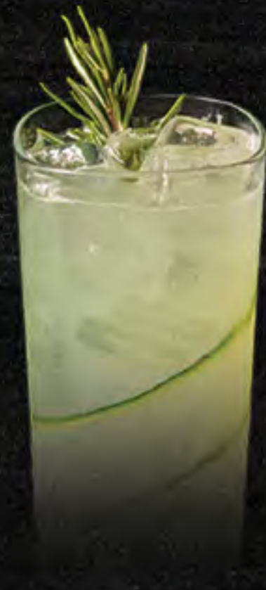
ROMERITO 17.98 Gin, Cucumber, Rosemary