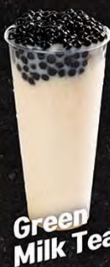
Green Milk Tea