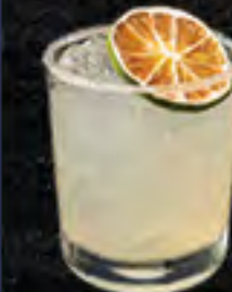
MARGARITA 16.98 Tequila, Triple Sec, Lime, Simple Syrup