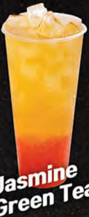
Jasmine Green Tea