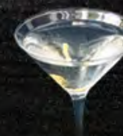
DRY MARTINI 16.98 Gin, Dry Vermouth