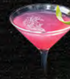
COSMOPOLITAN 16.98 Vodka, Cranberry Juice, Triple Sec