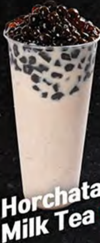
Horchata Milk Tea

Explore our full lineup of signature boba drinks!