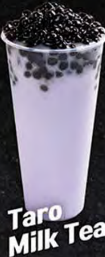
Taro Milk Tea