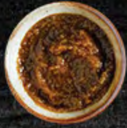
GARLIC & HERB