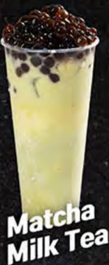
Matcha Milk Tea