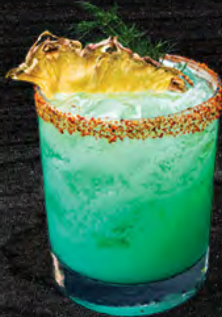
BLUE IGUANA 17.98 Rum, Blue Curacao, Mango, Condensed Milk