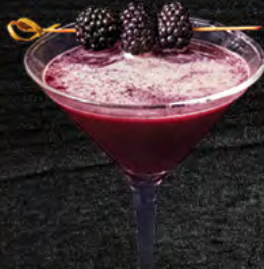
BLACKBERRY & NUTELLA MARTINI 17.98 Gin, Nutella, Blackberries