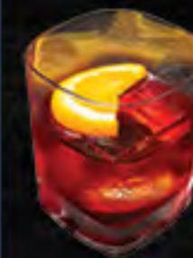
NEGRONI 15.98 Gin, Red Bitter, Sweet Vermouth