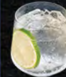
TEQUILA SODA 15.98 Tequila, Lime, Soda