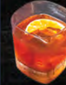
OLD FASHIONED 16.98 Bourbon, Angostura Bitters, Simple Syrup