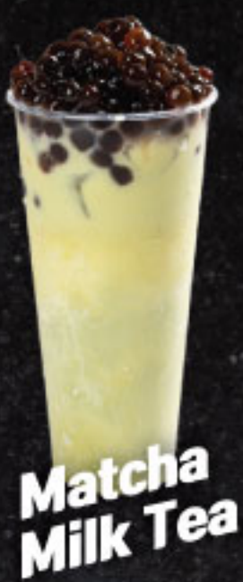
Matcha Milk Tea