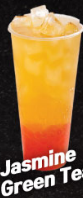
Jasmine Green Tea