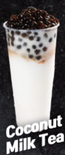
Coconut Milk Tea