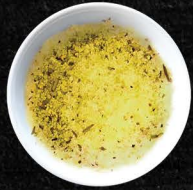
GREEN TEA SALT