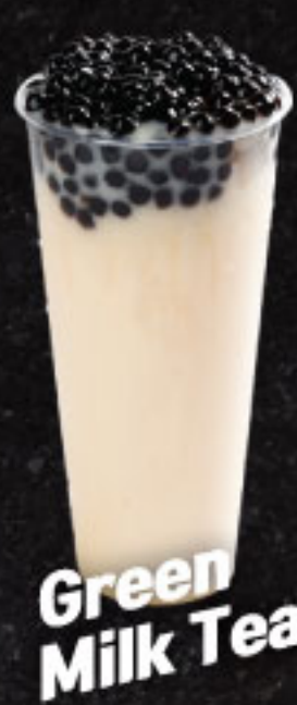
Green Milk Tea