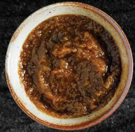
GARLIC & HERB