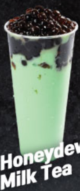
Honeydew Milk Tea