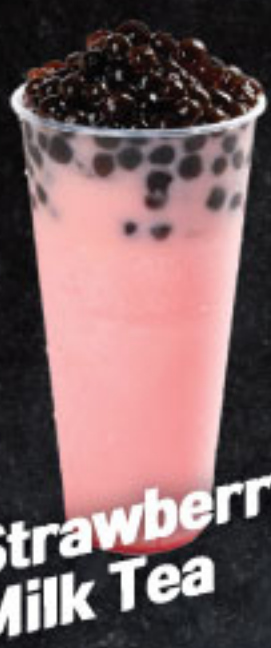
Strawberry Milk Tea