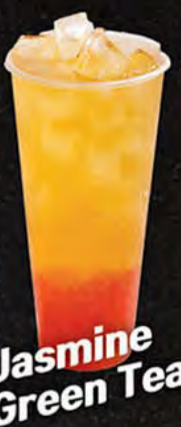
Jasmine Green Tea