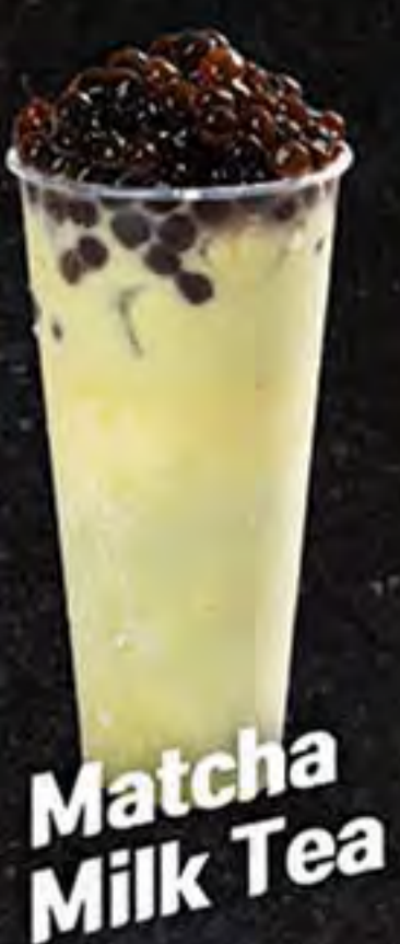
Matcha Milk Tea