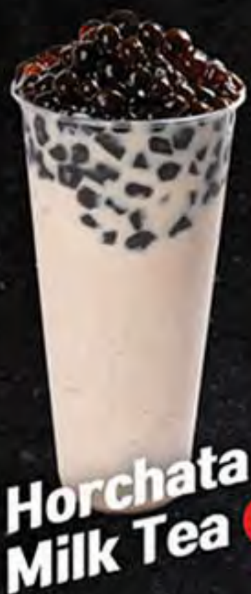
Horchata Milk Tea

Explore our full lineup of signature boba drinks!