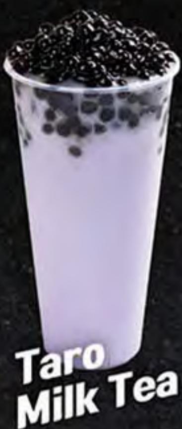
Taro Milk Tea