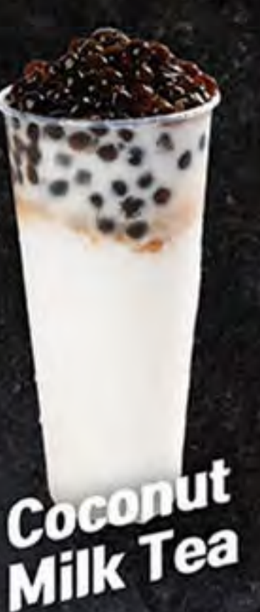
Coconut Milk Tea