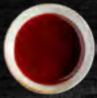
SWEET & SPICY