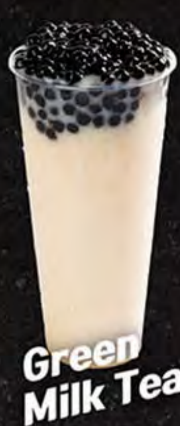
Green Milk Tea