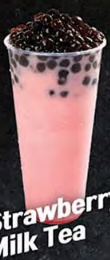
Strawberry Milk Tea