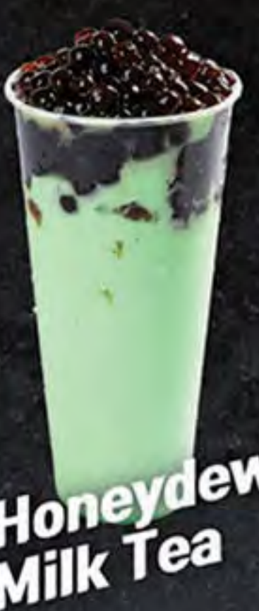
Honeydew Milk Tea