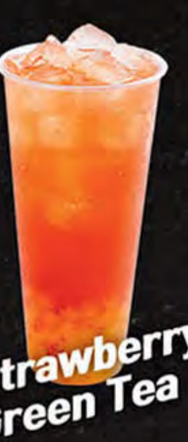
Strawberry Green Tea