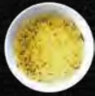
GREEN TEA SALT