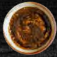
GARLIC & HERB