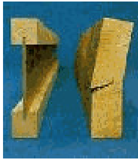
Fig. 3 An I-Joist and sawn timber