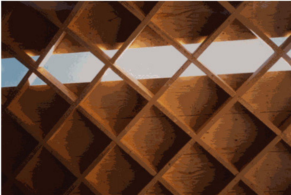
Fig. 1 Oekozentrum NRW, Hamm, Germany