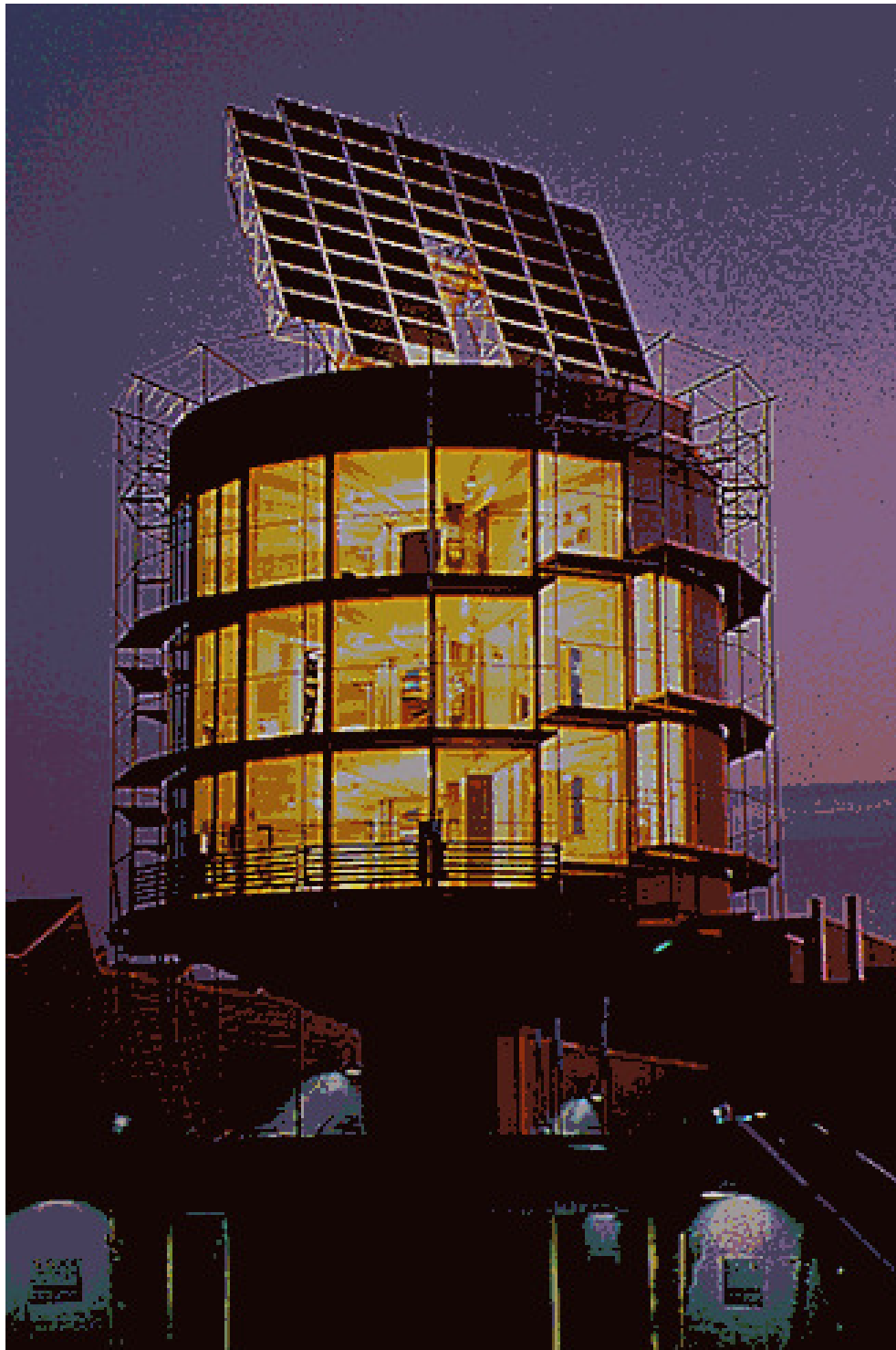
Fig. 8 Solar tower "Heliotrop", Freiburg, Germany