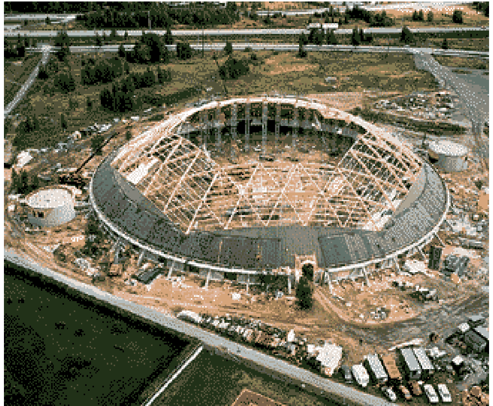
Fig. 5 Sports hall in Oulu, Finland