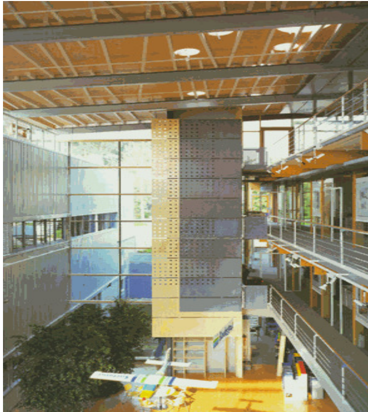
Fig. 8 Bureau Building, Sortimo

The Building Products Division's net sales in 1997 were FIM 542.7 million (FIM 566.9) and employed 657 people in the end of the year 1997.