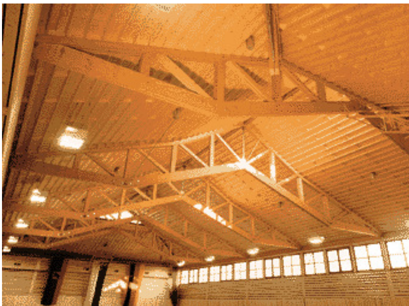
Fig. 6 Roof construction out of LVL-beams, Parkstein, Germany