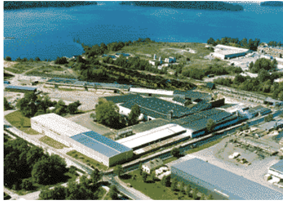
Fig. 7 Manufacturing plant in Lohja, Finland

Finnforest's and the KERTO business unit's KERTO-LVL experts world-wide work in close collaboration with the products end users. A high-quality customer-oriented product coupled with technical expertise in marketing is a powerful combination highly respected by professionals in the construction industry. KERTO continuously enhances its customer service and its products. Kerto-LVL products are further processed at the mill to fit the customer's application needs.