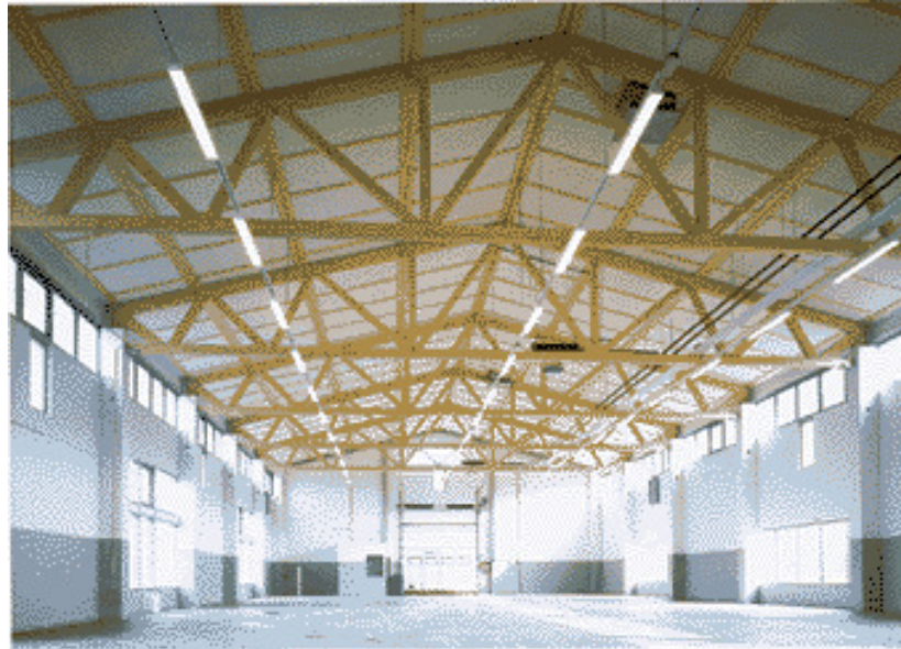
Fig. 10 Frame truss in Espoo, Finland