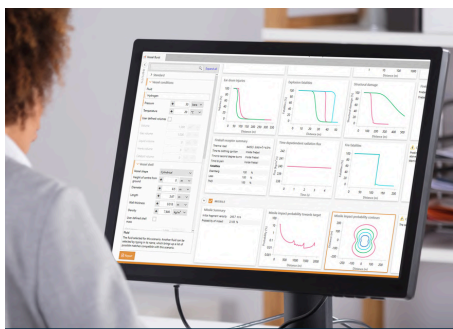
Analysing missile fragments after vessel burst