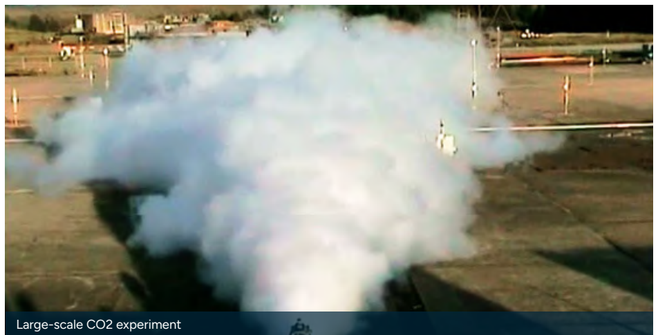
Large-scale CO 2 experiment

Use a background image with a chart or export consequences to a 3D platform to show the effects of accidental releases. Create visual results that can be clearly understood even by non-technical professionals.