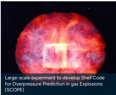
Large-scale experiment to develop Shell Code for Overpressure Prediction in gas Explosions (SCOPE)