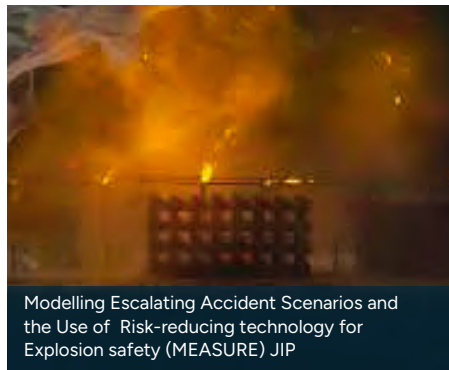
Modelling Escalating Accident Scenarios and the Use of Risk-reducing technology for Explosion safety (MEASURE) JIP