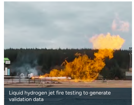
Liquid hydrogen jet fire testing to generate validation data