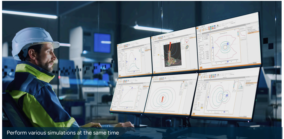
Perform various simulations at the same time

Utilise FRED to analyse the consequence of accidental releases at a production and storage facility, from a vehicle, or at a distribution terminal. It is applicable throughout the design, construction, operation, and modification phases.