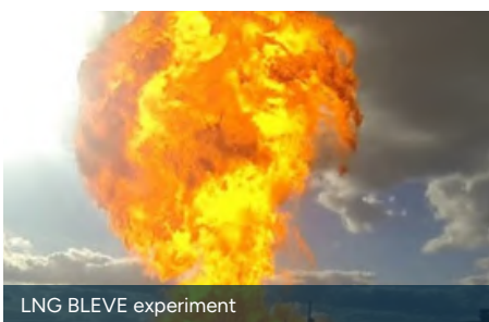
LNG BLEVE experiment

FRED includes over 1,200 chemical components, which can be blended to create custom compositions for your analysis. The thermodynamic package will accurately model the release behaviour of these mixtures.