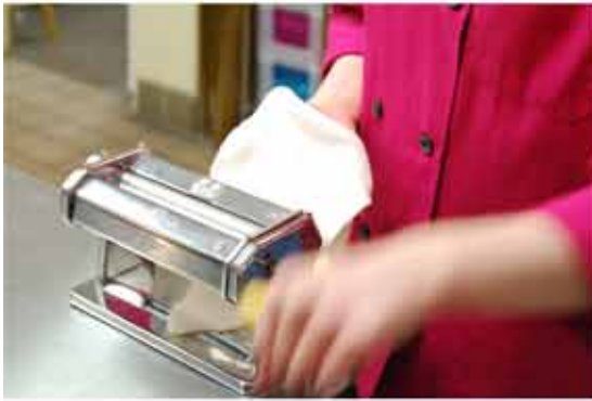
24. Roll more Gumpaste or Mexican Paste through a pasta machine on its third widest setting. If your pasta machine's settings start on a (0), then roll to a (2) setting.