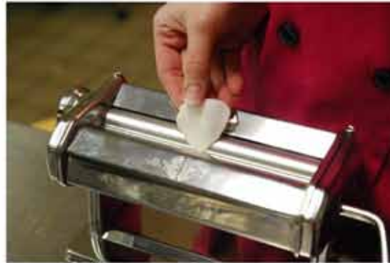
28. Roll the petal through the pasta machine vertically on the next smallest setting (5).

Repeat steps 27 and 28 with the remaining petals. Cover the petals in plastic wrap immediately to prevent them from drying out.