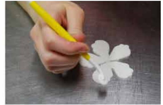
26. Cut the flower into five petals (same as in steps 3 and 4)