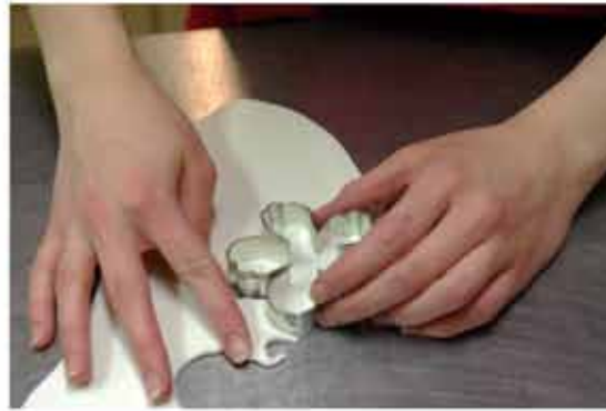
25. Cut out a third flower.