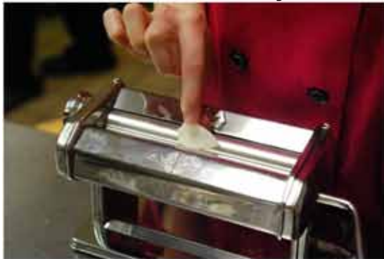
27. Roll the petal through the pasta machine horizontally on the next smallest setting (3) then again on a (4).