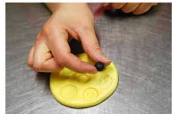
30. Roll a small ball of Black Mexican Paste.