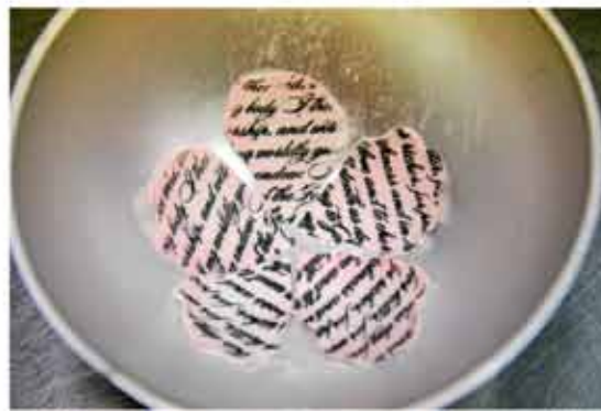
29. Dry the petals overnight in a Wilton Ball Pan, or a 6" diameter bowl dusted with cornstarch.

Mesh Stencil, ruffle, and tint the five new petals the same way you did the five larger petals (follow steps 7 through 15)