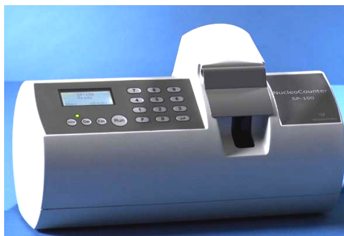
Figure 2. NucleoCounter with the small version of the lid, which can be used when measuring samples.

The NucleoCounter instrument is delivered with two lids. The larger of the two lids, shown on the figure above, protects the insertion area from dust and dirt. This lid should be placed on the instrument in the closed position when the instrument is not in use. The smaller of the two lids (see the figure below) protects the insertion area against ambient light. This lid is easier to handle and can replace the large lid if it is more convenient during a measurement session. However, for protection replace the small lid with the large lid, when the session is over.