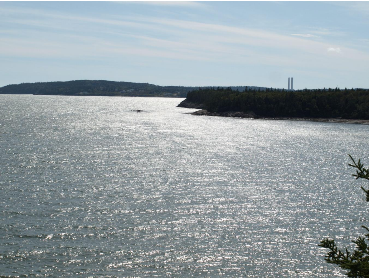
Bay of Fundy, Canada

So where does your team sit on the curve?