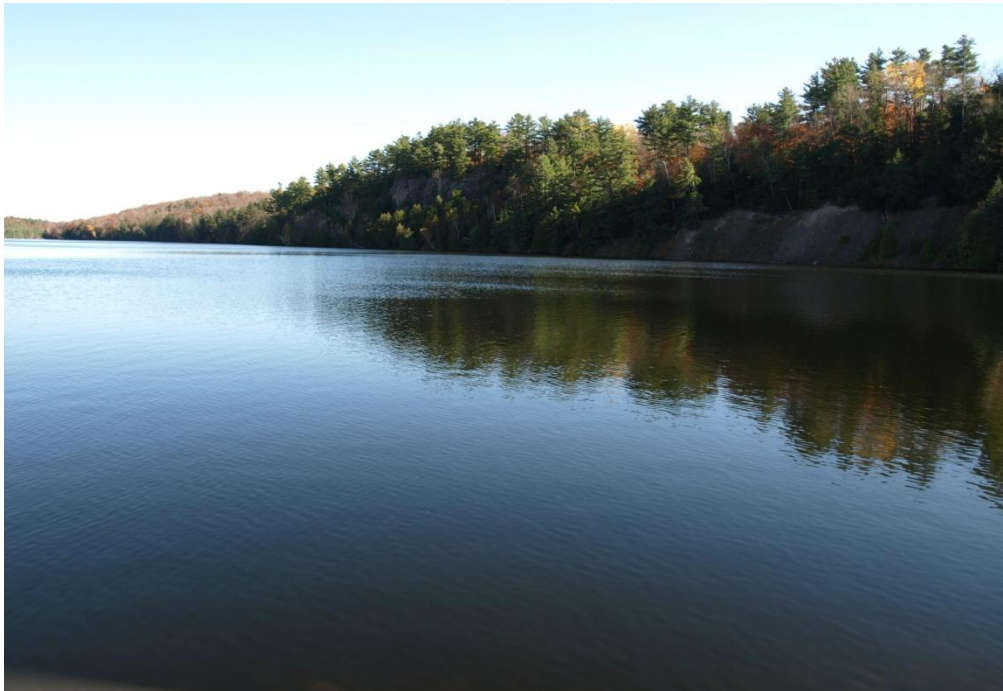
Madawaska River, Ontario, Canada