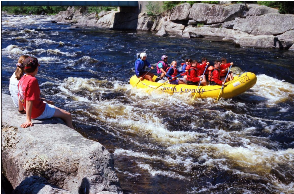
Penobscot River, Maine, U.S.A.

Don't forget that an effective team isn't just concerned with getting work done but also with how it gets done. Process (how decisions are made) is critical. Strong teams with solid leaders don't compromise or vote. They operate by consensus, guided by their common vision and purpose.