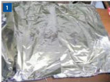
1 Use 18 in wide heavy-duty aluminum foil. Place two 26 in pieces side-by-side.

Note: Before taking samples, review details in Section 9.