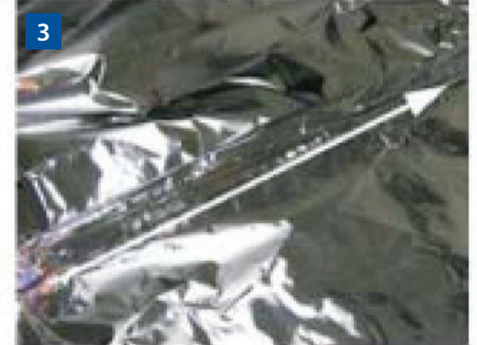
3 Lift the overlap, crease and fold flat for the length of the seam (26 in).