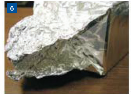
6 Pinch the foil on the ends and squeeze together.