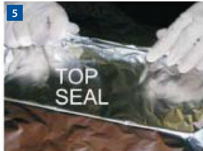
5 Join the side panels together at the top. Pinch the overlap, roll over twice and fold flat to seal.