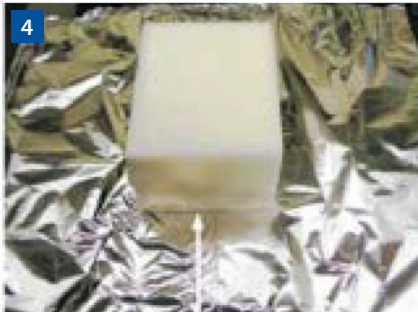
4 Place the foam sample in the center of the joined foil sheet lengthwise on top of the seam.