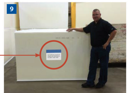
9 Take a photo of chemist or supervisor next to foam block from which sample was taken. Label the foam block with this information:

Remember: Only one sample per foil package.