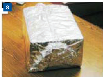
8 The finished foil wrapped sample should be tightly sealed on all sides.

Remember: Only one sample per foil package.