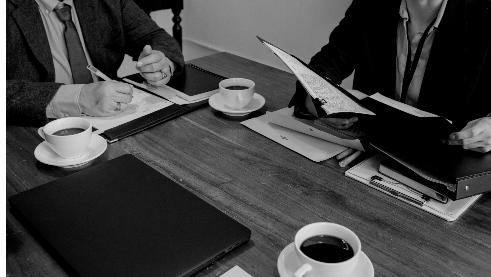
Table 5: Largest companies funded by PE/VC investors