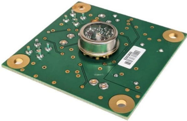
7511-PCB with 7511B-1-04 Receiver Mounted*