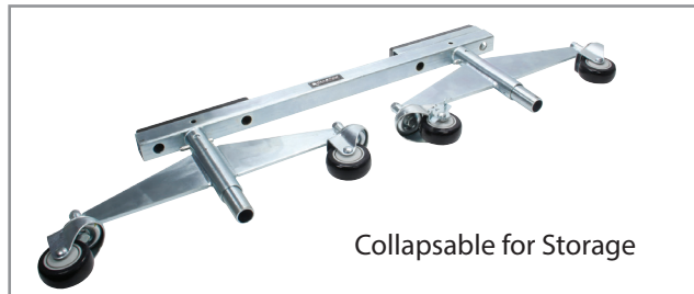
Collapsible for Storage