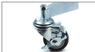
Swivel/Locking Casters (1 Locking Caster per Stand)