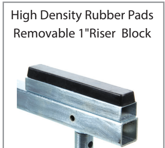
High Density Rubber Pads Removable 1" Riser Block